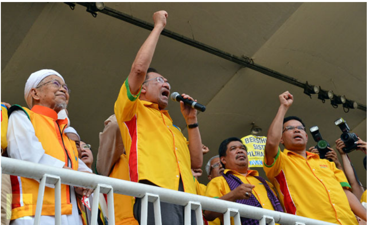
Despite Bersih’s best efforts to portray itself as apolitical, it is clearly led for and by Malaysia’s US-backed opposition, with the IMF’s Anwar Ibrahim leading the coalition. Here, Anwar Ibrahim (center) can be seen speaking to a Bersih rally in Malaysia.

“He and other Australian MPs were to meet opposition leader Anwar Ibrahim, as well as Malaysia’s minister in charge of parliamentary affairs, Mohammed Nazri, and members of the group Bersih, the Coalition for Clean and Fair Elections.”