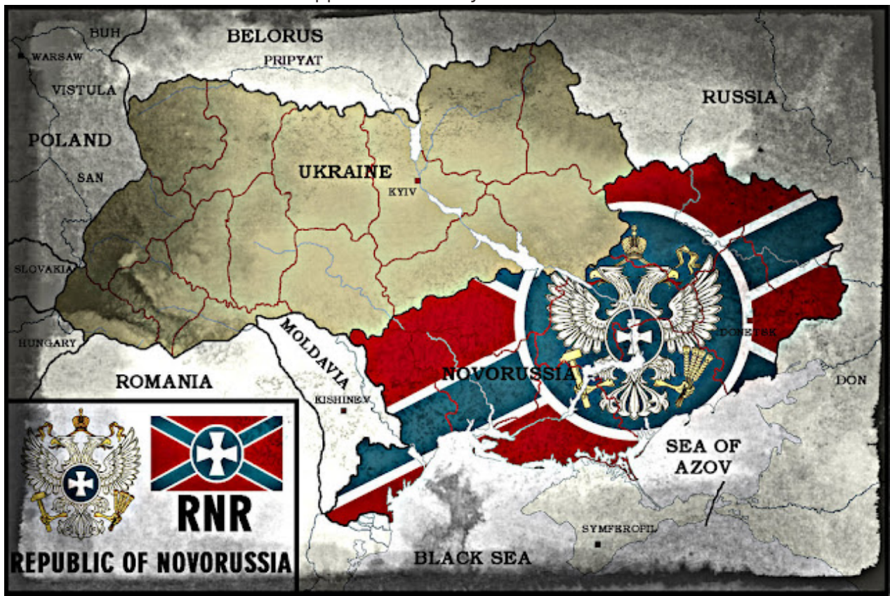
Image : The rebels' "New Russia" vision may be far flung, but they have already achieved a large degree of self-autonomy and have shown Kiev that dictating the future of eastern Ukraine will not be done without a fight.

The Oregon ranchers have already painted themselves into a corner with their polarizing