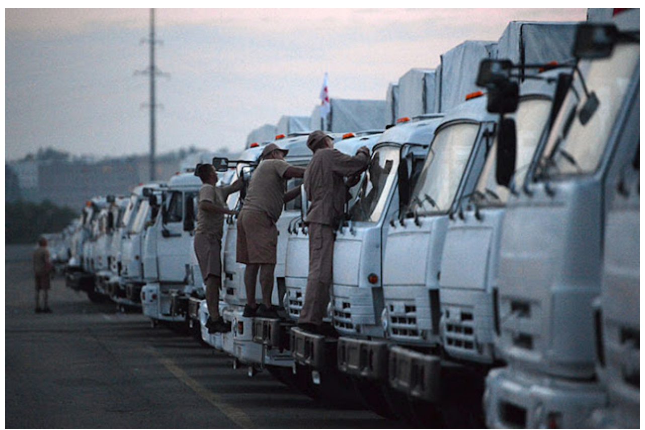
4. Endgame: The Donbass fighters are part of a larger movement seeking to create an entirely self-sufficient, functional political entity. In many ways they have already succeeded in doing this. They are doing so with overwhelming military force, and tremendous popular support both locally and abroad.