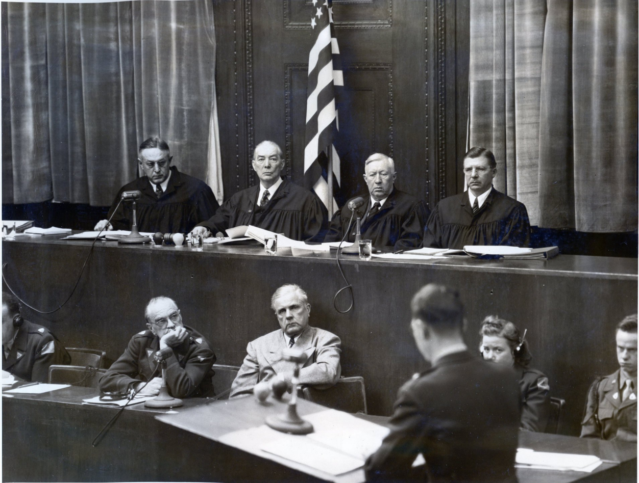
Nuremberg Doctors Trial