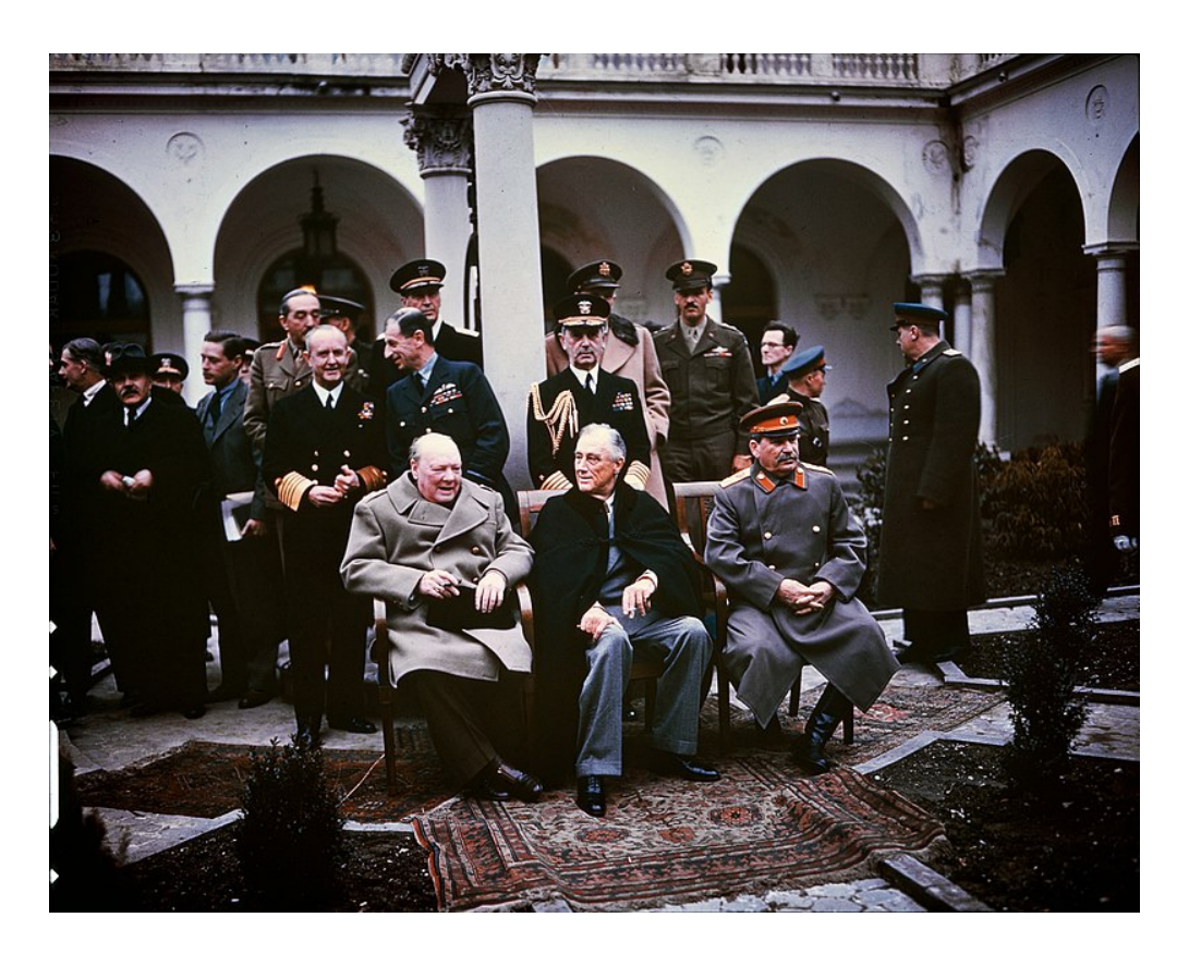
The "Big Three" at the Yalta Conference: Winston Churchill, Franklin D. Roosevelt and Joseph Stalin, 1945.