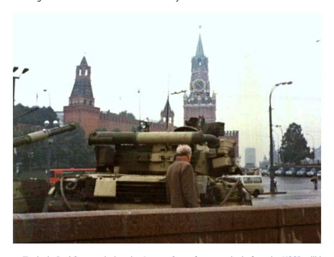
Tanks in <u>Red Square</u> during the <u>August Coup</u>, four months before the <u>USSR</u> will be dissolved, 1991.

seize Odessa and Crimea. Britain Sought to seize the rich oil fields in the black sea region near present day Chechnya. Germany installed fascist puppets in the Baltic. Poland seized a huge portion of Russian territory. Encircled and invaded on every side amazingly the communists were victorious and regained control of most of their territory. It was one of the most glorious victories in human history.