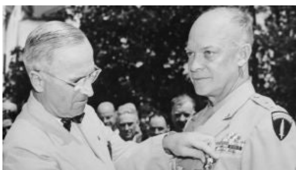
Harry Truman and Dwight Eisenhower

They massacred refugees fleeing south since they worried some of them might be communists. The Americans continued their war on the South Koreans throughout the war and in reality it continues to this day. Using their Naval superiority MacArthur staged a landing at the Port of Inchon leveling the city and unleashing Rhee's troops and fascist death squads on the survivors. The North Korean army was forced to retreat or risk being cut off. Now the UN forces decided to invade North Korea and reunify the whole country under Rhee's dictatorship. They advanced steadily but the North Korean forces were actually regrouping far to the North as well as setting up a guerrilla army behind UN lines. MacArthur was deliberately attempting to provoke the Chinese he hoped to expand the war into China. He hoped that backed up by a nuclear attack on China Chiang would be able to retake China. He even went so far as to conceal a Chinese counter attack and lie to Truman personally afterwards claiming he believed China would not enter the war when they already had.