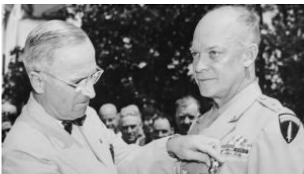
Harry Truman and Dwight Eisenhower

They massacred refugees fleeing south since they worried some of them might be communists. The Americans continued their war on the South Koreans throughout the war and in reality it continues to this day. Using their Naval superiority MacArthur staged a landing at the Port of Inchon leveling the city and unleashing Rhee's troops and fascist death squads on the survivors. The North Korean army was forced to retreat or risk being cut off. Now the UN forces decided to invade North Korea and reunify the whole country under Rhee's dictatorship. They advanced steadily but the North Korean forces were actually regrouping far to the North as well as setting up a guerrilla army behind UN lines. MacArthur was deliberately attempting to provoke the Chinese he hoped to expand the war into China. He hoped that backed up by a nuclear attack on China Chiang would be able to retake China. He even went so far as to conceal a Chinese counter attack and lie to Truman personally afterwards claiming he believed China would not enter the war when they already had.