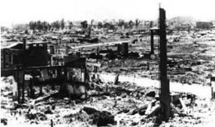
Pyongyang in Rubble (1953)

The “loss” of China would lead the next year to a massive escalation of the war in Korea. Most people believe that the Korean War began in 1950 when North Korea invaded South Korea. This is another example of cold war propaganda becoming enshrined in mainstream history. In reality South Korea (spurred on by the Dulles brothers, General Macarthur and the China Lobby) probably attacked North Korea in 1950 provoking a North Korean counter attack. South Korea had been launching military offensives against North Korea aimed at seizing a foothold and also sending small bands of terrorists to wreak havoc.