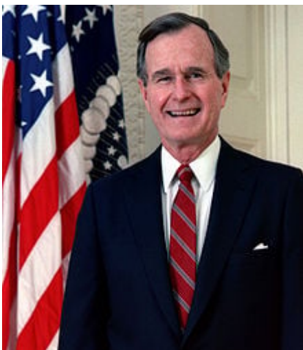
George Bush Sr's position as head of the CIA under Reagan

The mosaic of BCCI connections surrounding Harken Energy may prove nothing more than how ubiquitous the rogue bank's ties were ... But the number of BCCI-connected people who had dealings with Harken—all since George W. Bush came on board—likewise raises the question of whether they mask an effort to cozy up to a presidential son. 18