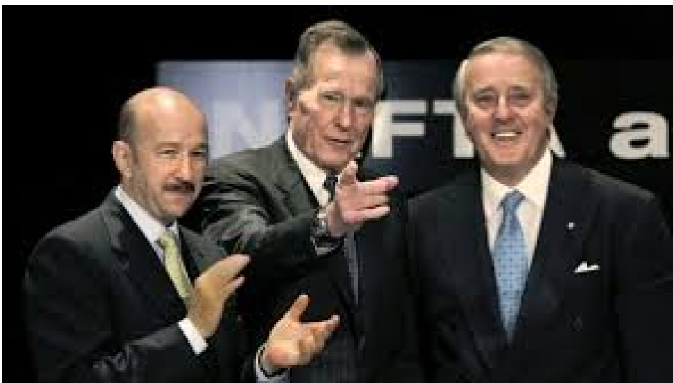
President Carlos Salinas de Gortari, President George H. W. Bush, Canada’s Prime Minister Brian Mulroney

Had this been known, the NAFTA agreement would not have seen the light of day.