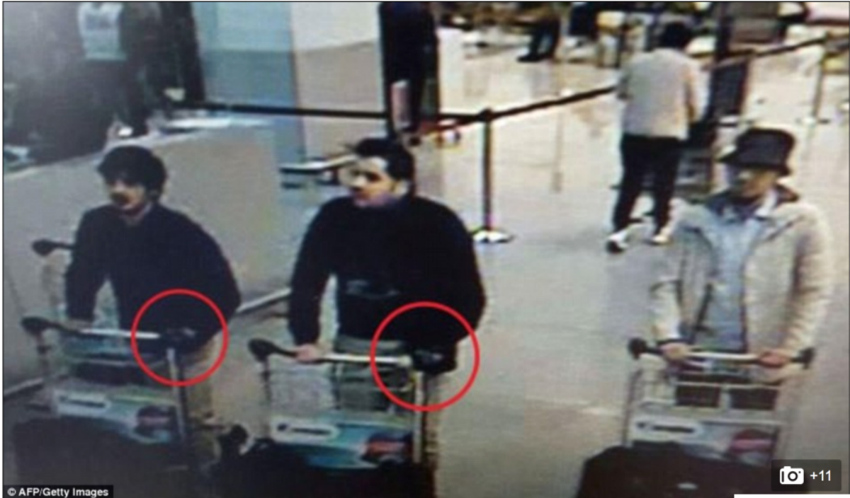
Caught on camera: Bomber Ibrahim El Bakraoui (centre) and explosives expert Najim Laachraoui (left), with their accomplice (right), who remains on the run

They are being hunted along with the fifth individual, the 'Man in White', who was seen dressed in a raincoat and hat ahead of Tuesday's airport attack. In the wake of the disaster, the worst terror attack ever to hit Belgium, the country's interior and justice ministers both offered to resign today.