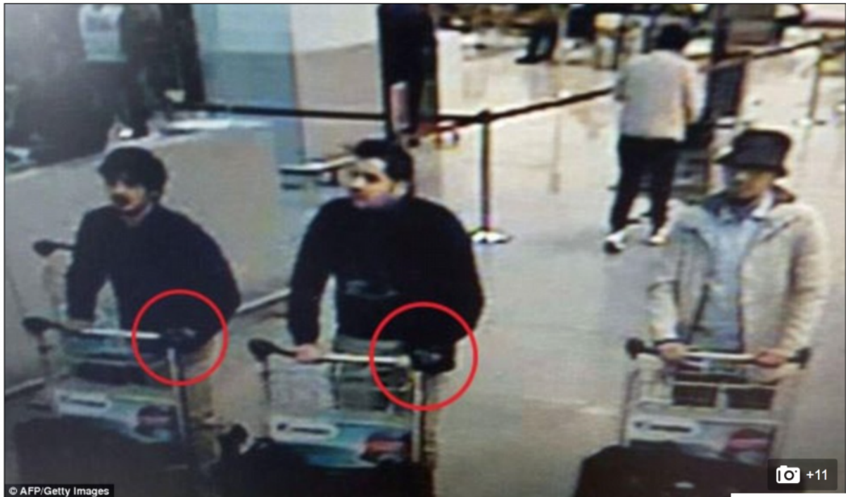
Caught on camera: Bomber Ibrahim El Bakraoui (centre) and explosives expert Najim Laachraoui (left), with their accomplice (right), who remains on the run

They are being hunted along with the fifth individual, the 'Man in White', who was seen dressed in a raincoat and hat ahead of Tuesday's airport attack. In the wake of the disaster, the worst terror attack ever to hit Belgium, the country's interior and justice ministers both offered to resign today.