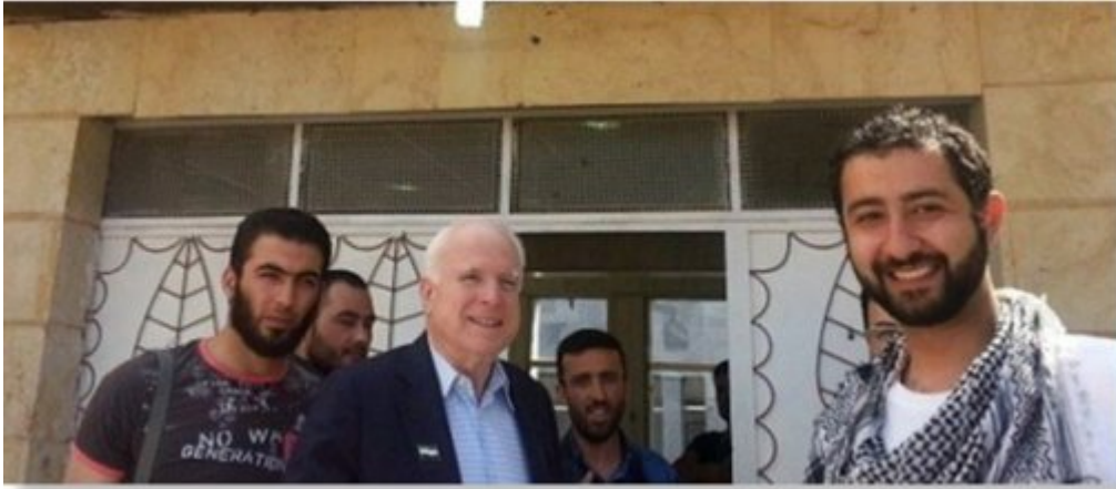
Friends in low