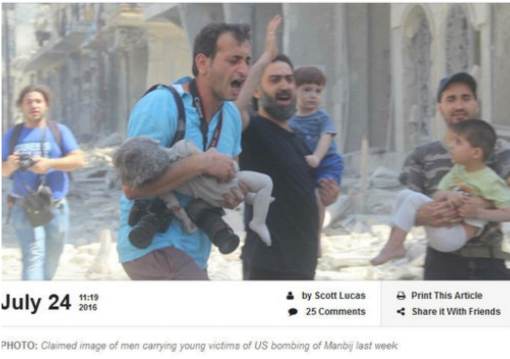
Aftermath of US bombing of Manbij last month

Recognizing a propaganda opportunity when they see one, within hours most Western media outlets had headlined the image along with emotionally-manipulative screeds penned by media hacks who couldn't care less about Omran or Syria. When the US military killed 73 civilians in Syria last month , images of the carnage, like the one below, didn't make the cut, for some strange reason.