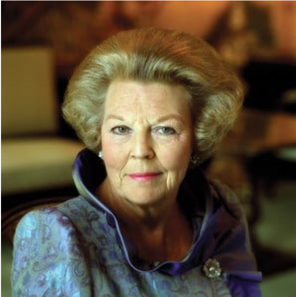
Queen Beatrix of the Netherlands, the largest shareholder in Royal Dutch Shell

Among the members of the Bilderberg Group are various European monarchs. At this year's meeting, Queen Beatrix of the Netherlands was present, who happens to be the largest single shareholder in Royal Dutch Shell, one of the world's largest corporations. She was joined by one of her three sons, Prince Constantijn, who also attended the meeting. Prince Constantijn has worked with the Dutch European Commissioner for the EU, as well as having been a strategic policy consultant with Booz Allen & Hamilton in London, a major strategy and technology consulting firm with expertise in Economic and Business Analysis, Intelligence and Operations Analysis and Information Technology, among many others. Prince Constantijn has also been a policy researcher for RAND Corporation in Europe. RAND was initially founded as a global policy think tank that was formed to offer research and analysis to the US Armed Forces, however, it now works with governments, foundations, international organizations and commercial organizations.[26] Also present among European Royalty was Prince Philippe of Belgium, and Queen Sofia of Spain.