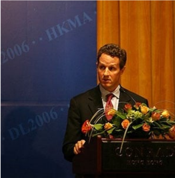
US Treasury Secretary Timothy Geithner, former President of the Federal Reserve Bank of New York

Bloomberg reported that, “The Obama administration may call for stripping the Securities and Exchange Commission of some of its powers under a regulatory reorganization,” and that, “The proposal, still being drafted, is likely to give the Federal Reserve more authority to supervise financial firms deemed too big to fail. The Fed may inherit some SEC functions, with others going to other agencies.” Interestingly, “SEC Chairman Mary Schapiro’s agency has been mostly absent from negotiations within the administration on the regulatory overhaul, and she has expressed frustration about not being consulted.”