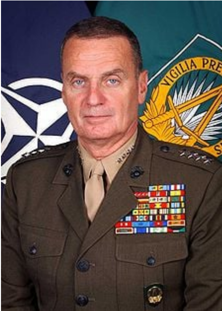
National Security Adviser General James Jones

The Obama administration was heavily represented at this year's Bilderberg meeting. Among the attendees were Keith B. Alexander, a Lieutenant General of U.S. Army and Director of the National Security Agency, the massive spying agency of the United States; Timothy Geithner, US Treasury Secretary and former President of the Federal Reserve Bank of New York; Richard Holbrooke, the Obama administration's special envoy for Afghanistan and Pakistan; General James Jones, United States National Security Advisor; Henry Kissinger, Obama's special envoy to Russia, longtime Bilderberg member and former Secretary of State and National Security Advisor; Dennis Ross, special advisor for the Persian Gulf and Southwest Asia to Secretary of State Hillary Clinton; David Petraeus, Commander of CENTCOM, (U.S. Central Command, in the Middle East), Lawrence Summers, Director of the White House's National Economic Council, former Treasury Secretary in the Clinton administration, former President of Harvard University, former Chief Economist of the World Bank; Paul Volcker, former Governor of the Federal Reserve System and Chair of Obama's Economic Recovery Advisory Board; Robert Zoellick, former Chairman of Goldman Sachs and current President of the World Bank; [30] and Deputy Secretary of State James Steinberg. [31]