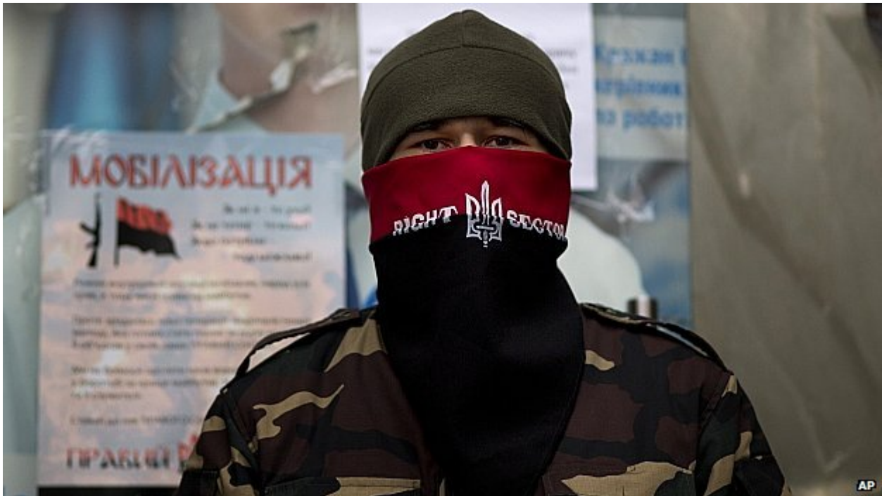
[BBC Photo of a Right Sector Good Guy, included in the original article]

“The Right Sector is trying to portray itself as a responsible party, but enough doubts remain about its attitude and intentions to cause unease in both pro-Kiev and pro-Moscow camps.” [emphasis added]