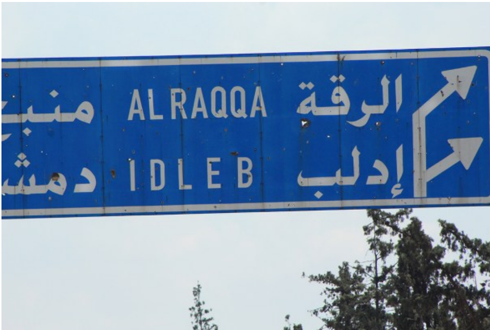
RAQQA & IDLIB: Two terrorist strongholds in Syria, with battles coming soon

Northern Front: Last August, Turkey invaded Syria in what was dubbed “ Operation Euphrates Shield ,” in an effort to stop Kurdish forces from connecting Afrin in northwestern Syria with the strategic town of Manbij. This was eventually followed by US ground forces in the form of Ranger Units and Marines deployed to support the newly formed ‘Syrian Democratic Forces’ (SDF), who are essentially Kurdish YPG militias with an additional patch on their arm and more US money and weapons. This is part of the Race to Raqqa , dubbed by the SDF as “Wrath of the Euphrates” – an operation designed to defeat ISIS there, where a very complicated and potentially dangerous conclave has already formed which includes terrorist militants ISIS, FSA, Al Nusra, along with US forces , Russian Special Forces, Kurdish militia, Turkish forces, British Special Forces , French Special Forces , and of course the Syrian Arab Army (let us not forget it’s their country, too). Kurdish SDF forces are doing the heavy lifting against ISIS and a number of front lines are forming including Deir ez-Zor, Tal al-Samam and Tabaqa. Aside from Syria, Russia and the Kurdish militias, none of those international deployments inside Syria are legal, but they are being tolerated, and the situation is being managed , in the interests of not triggering a major conflagration between the major powers.