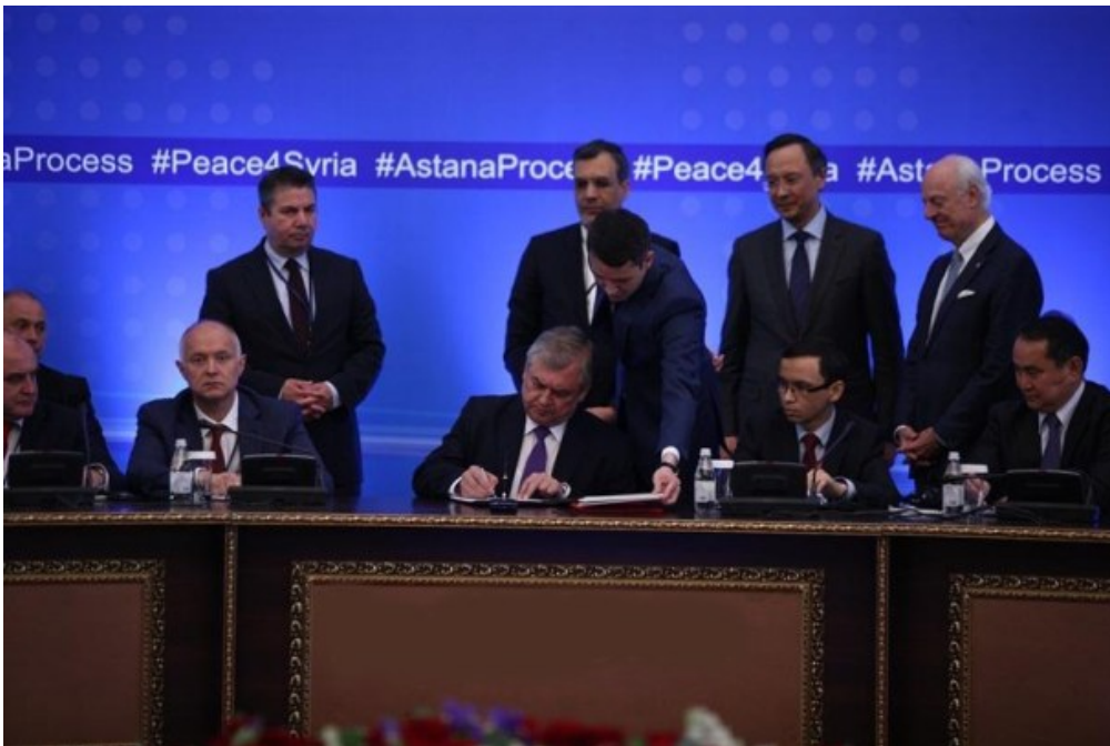
Astana Memorandum was signed last week

It's important to note that these are the chief highlights of US 'diplomacy' in Syria, and its string of screw-ups. Washington and its partners have only themselves and these fabricated crisis situations to blame for being sidelined on any potential diplomatic solution for Syria.