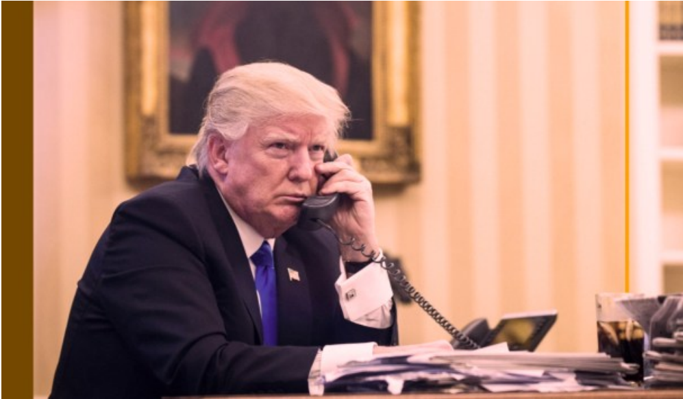
IMAGE: US President Donald Trump went head over heels for the alleged ‘chemical attack’ in Khan Sheikhun, Idlib on April 4, 2017, Idlib.