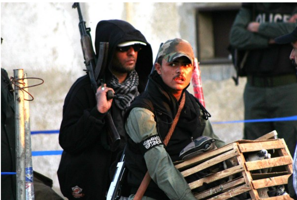
Al Nusra fighters were among the evacuees from al-Waer in Homs in April

For this reason, all of the Geneva meetings on Syria cannot be a leading forum, and are effectively another ineffective talking shop, as the US-led Coalition has basically ditched International Law when it comes to Syria. The same argument could be extended to Yemen as well.