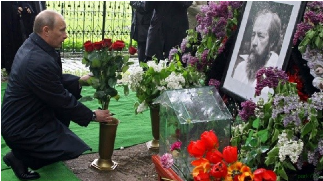
PROPAGANDA'S ROLE REVERSAL: "It's only feigned reverence, obviously Neo-Soviet propaganda."

Communist influence on American society and culture during the era of the Cold War shouldn't be wholly discounted. In fact, the neo-Marxist Frankfurt School certainly left its mark, though often exaggerated, on the deconstruction of traditional institutions in the West. But often overlooked by anti-communist conspiracy theorists is the reality that cultural Bolsheviks like Herbert Marcuse and Theodor Adorno didn't receive their marching orders from Moscow, a power which they disdained, but rather were assets of Western elites and their intelligence apparatus, particularly the U.S. Office of Strategic Services (OSS), the forerunner of the CIA. Nor did Bolshevism in the first part of the 20th century spawn indigenously from Russian soil, like Athena from the head of Zeus. Rather, the dictatorship of the proletariat was helped along in its ascendancy by oligarchs in New York and London.