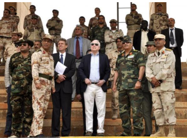
Image: Sen John McCain, head of the International Republican Institute, and Libyan terrorist military leader Abdel-Fattah Younis (R) of the Transitional National Council tour their headquarters in the city of Benghazi on April 22, 2011. McCain praised Libyan terrorists as his “heroes” in a visit to their de facto capital, one day after the US started flying armed Predator drones to bolster NATO firepower and try to break a battlefield stalemate with