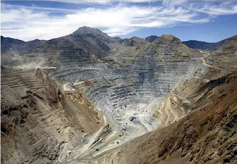
A photo of a massive Antofagasta open pit copper mine in Chile.

Technology itself, including “green” technologies such as solar power and wind turbines, also relies upon resources that leave a carbon footprint. Solar panels require the use of arsenic, aluminum, cadmium, copper, gallium, silver, tellurium and other metals. Wind turbines require steel alloys, nickel, chromium, aluminum and manganese. Most of these metals require mining, and all mining operations rely upon fossil fuels and emit greenhouse gases. Mining also contributes to ecological depletion of trees, flora and advances soil degradation. For sure, technologies will buy time. But none of them are the silver bullet to slam on the breaks of accelerated warming altogether. Perhaps one of the only promising solutions is an enormous scaling back on progress and development, which follows the old 1970s mantra “reduce, reuse, recycle.” But such a policy is completely contradictory to the entire neoliberal economic machine that fuels corporate globalization and expanding markets. In short, climate change and the environment are moral issues, and free market capitalism, according to Jerry Mander and founder of the International Forum on Globalization, is fundamentally amoral and without any human value other than currency.