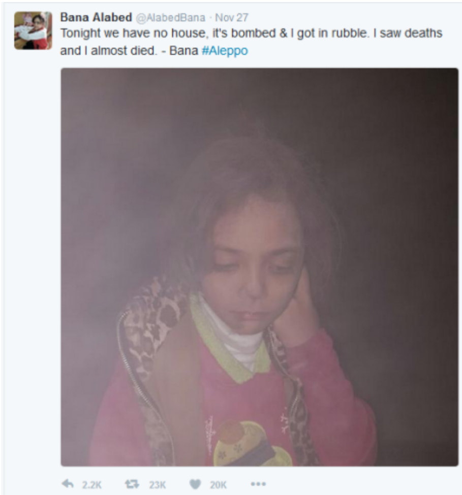
Bana's tweet when she lost her home

At the same time, the activity of the government troops was concentrated in the area to the south of the city of Hanano. So, the question arises: why does the girl insist on her house was fired and ruined while none of the parties opened fire near her house.