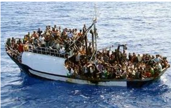
Fomenting class war between the refugees

As Western wars advance, the desperate refugees multiply. The poor and destitute clamber at the gates of the imperial heartland crying: 'Your bombs and your destruction of our homelands have driven us here, now you must deal with us in your homeland ' .