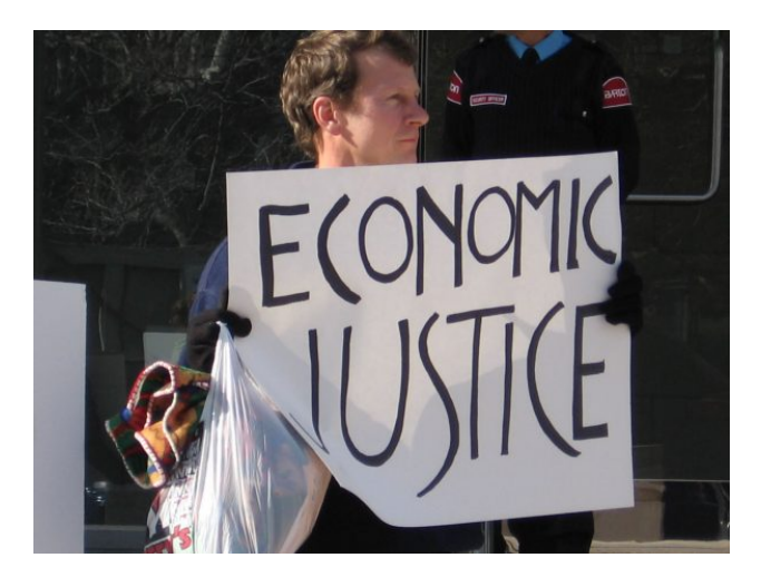
What The People Are Demanding

Image on the right: From Catholic News USA.