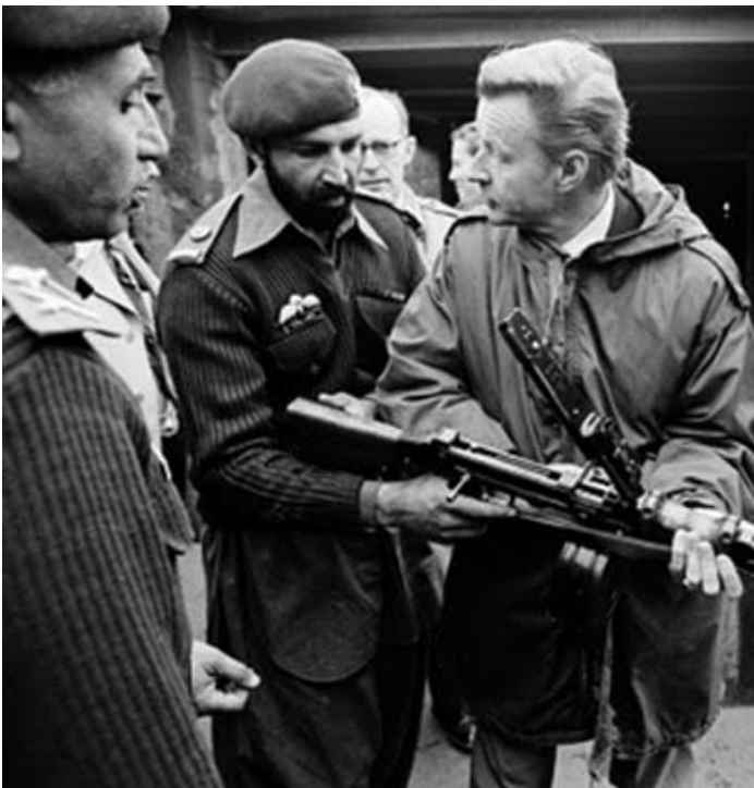
Osama bin Laden with President Carter's National Security Advisor Zbigniew Brzezinski

1996: The Saudi Arabian government is financially supporting Osama bin Laden's Al Qaeda and other extremist groups. After 9/11, the Bush Administration does nothing to confront the Saudi leadership over its support of terror organizations and its refusal to help in the investigation. [ New Yorker, 10/22/01 , more ]