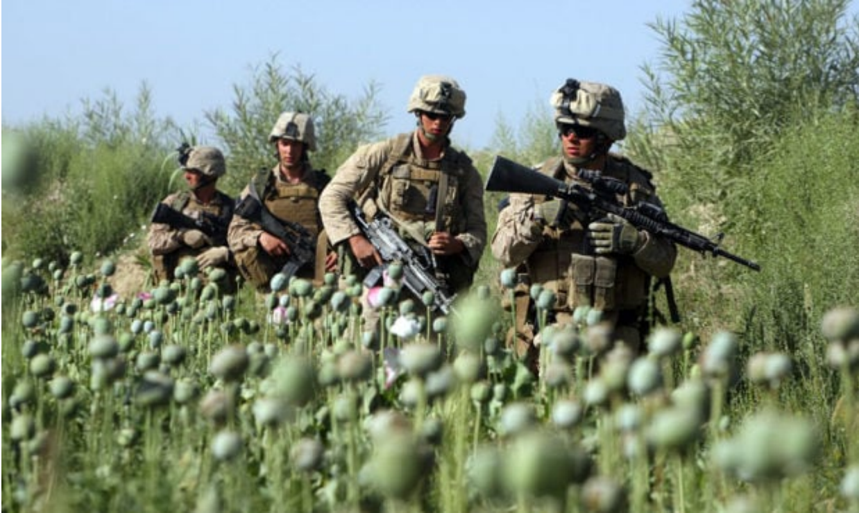
Troops in Afghanistan's Opium Fields

Feb 21, 2002: A ban on poppy growing by the Taliban in July 2000 along with severe droughts reduced Afghanistan's opium yield by 91% in 2001. Yet the UN expects its 2002 opium crop to be equivalent to the bumper one of three years ago. Afghanistan is the source of 75% of the world's heroin. [ Guardian, 2/21/02 ] Why is the US unable to control opium production which had almost stopped?