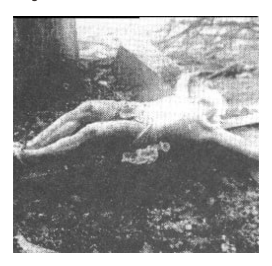
An irradiated crucifix lies in the ruins of the Urakami Cathedral Following the Atomic Bombing of Nagasaki

Ironically, prior to the bomb exploding nearly directly over the Urakami Cathedral at 11:02 AM, Nagasaki was the most Christian city in Japan, and the massive cathedral was the largest Christian church in the Orient.