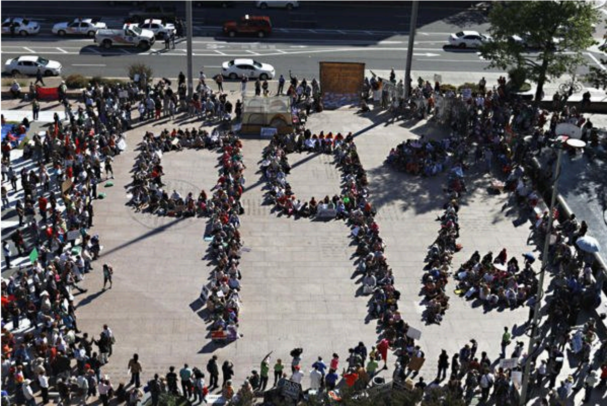
From Occupy Washington DC at Freedom Plaza.