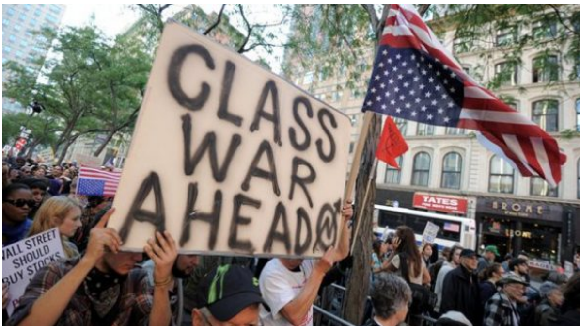
Occupy Wall Street 2011.

protects the duopoly of Democrats and Republicans.