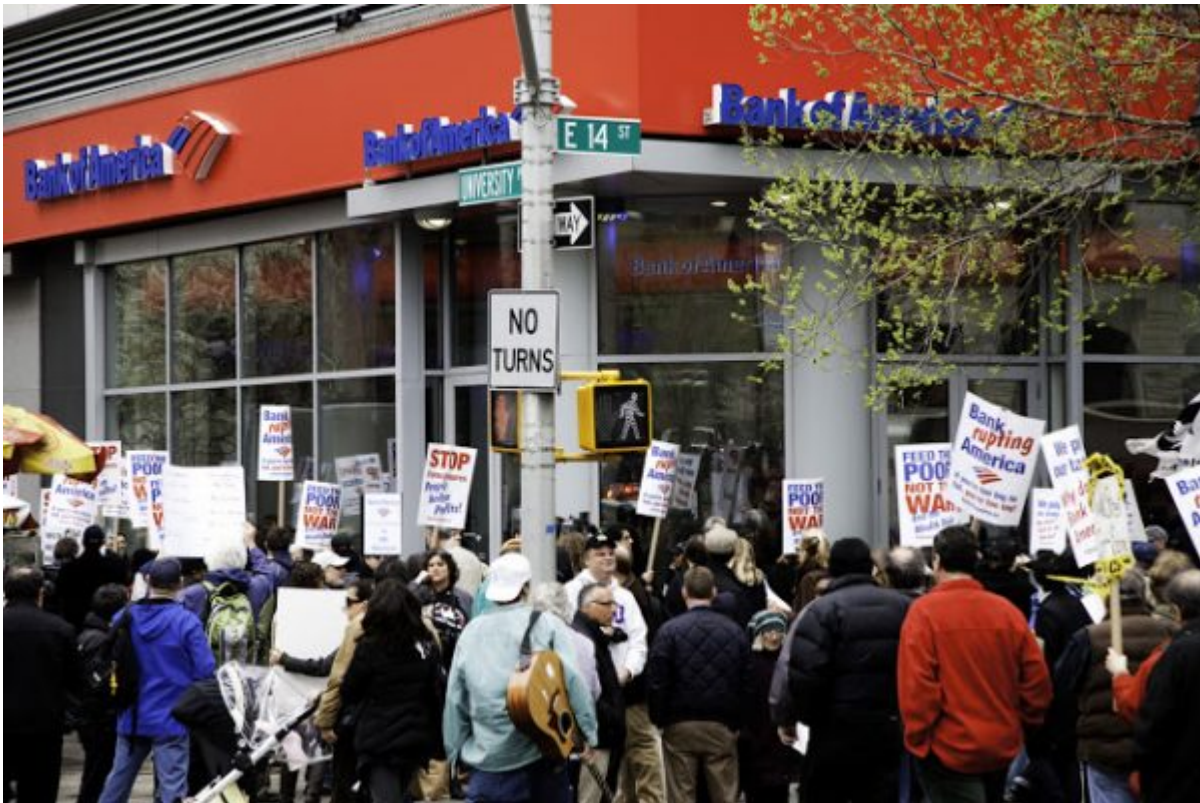
Protest near Union Square in New York, April, 2010. Popular Resistance.