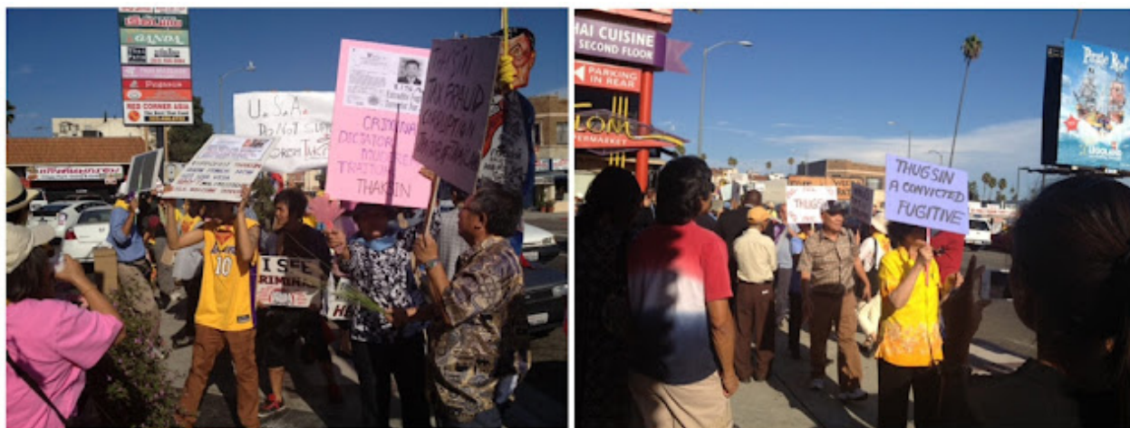
Image: August 2012, Thaksin Shinawatra attempted to speak before members of his own personality cult, the “red shirts” in Los Angeles, but was picketed by protesters hoisting placards reading, “Criminal, Dictator, Murderer, Traitor, Thaksin,” and “Thugsin, A Convicted Fugitive.” While the US rails against nations like Syria and its alleged “human rights abuses,” one must wonder where the US Secretary of State’s conscience (or official responsibility) was when allowing a fugitive and mass murderer into the United States.

Thaksin’s mass murdering of 3,000 innocent people in 90 days alone should have earned him eternal scorn and international ostracism, but instead as recent as last year, this grotesque human rights violator was given special entry into the United States despite his fugitive status, to give a talk that was only disrupted by brave Thai-Americans who stood up where international law and decency crumbled.