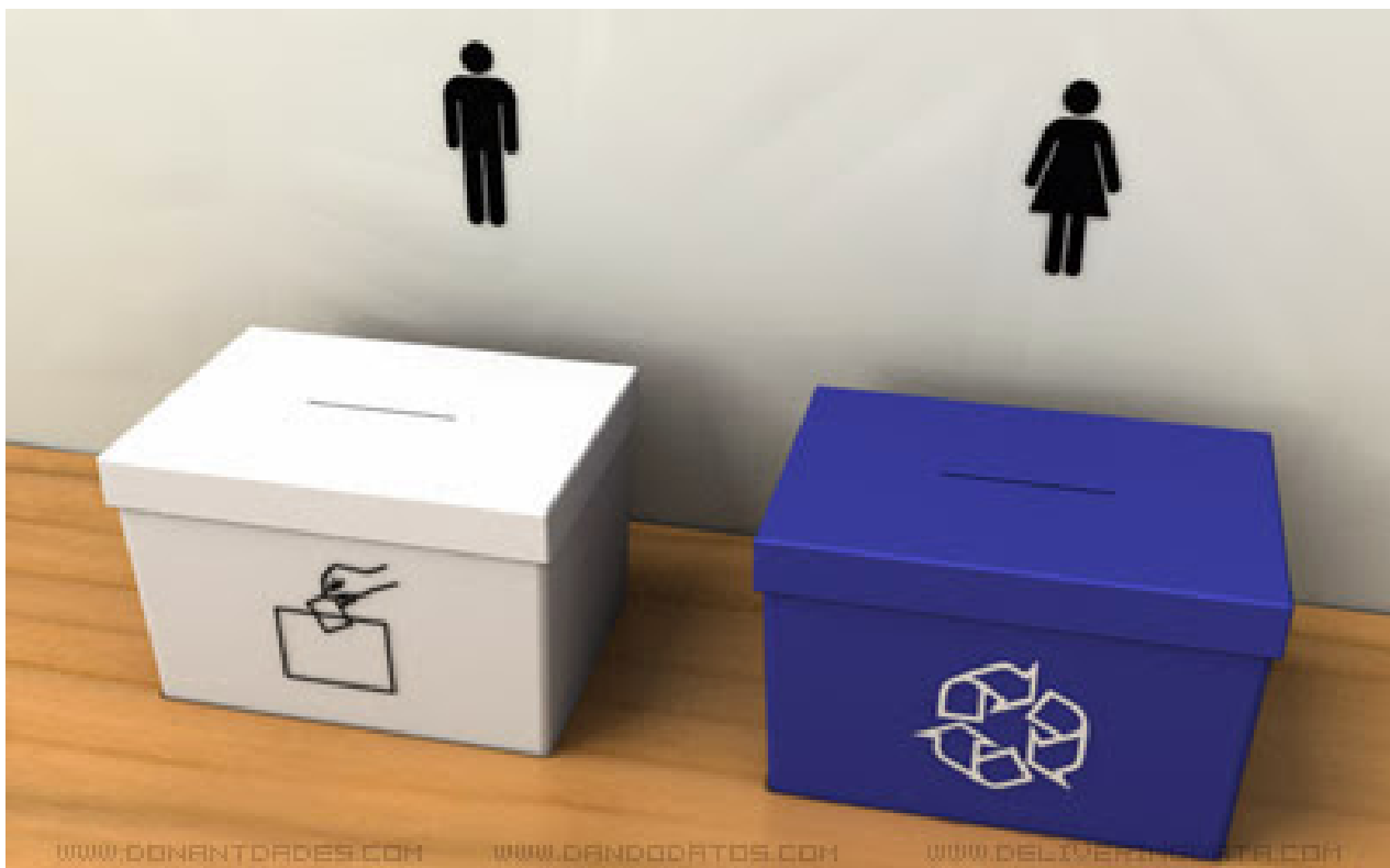
Image: In Saudi Arabia, women are not allowed to vote (or even drive for that matter). Despite this gross injustice, the autocratic feudal regime is one of the West's closest allies and exists in a media black-hole of immunity and self-censorship. This reveals that what is considered "acceptable" and "unacceptable" by international standards is solely based on Western interest - not objective,

A similar tale can be told of North Korea's elections - with its one-party government enjoying "landslide victories" as reported in the Telegraph's " Elections declared a success in one party North Korea ." Similarly, the West has no problem making a mockery of the process