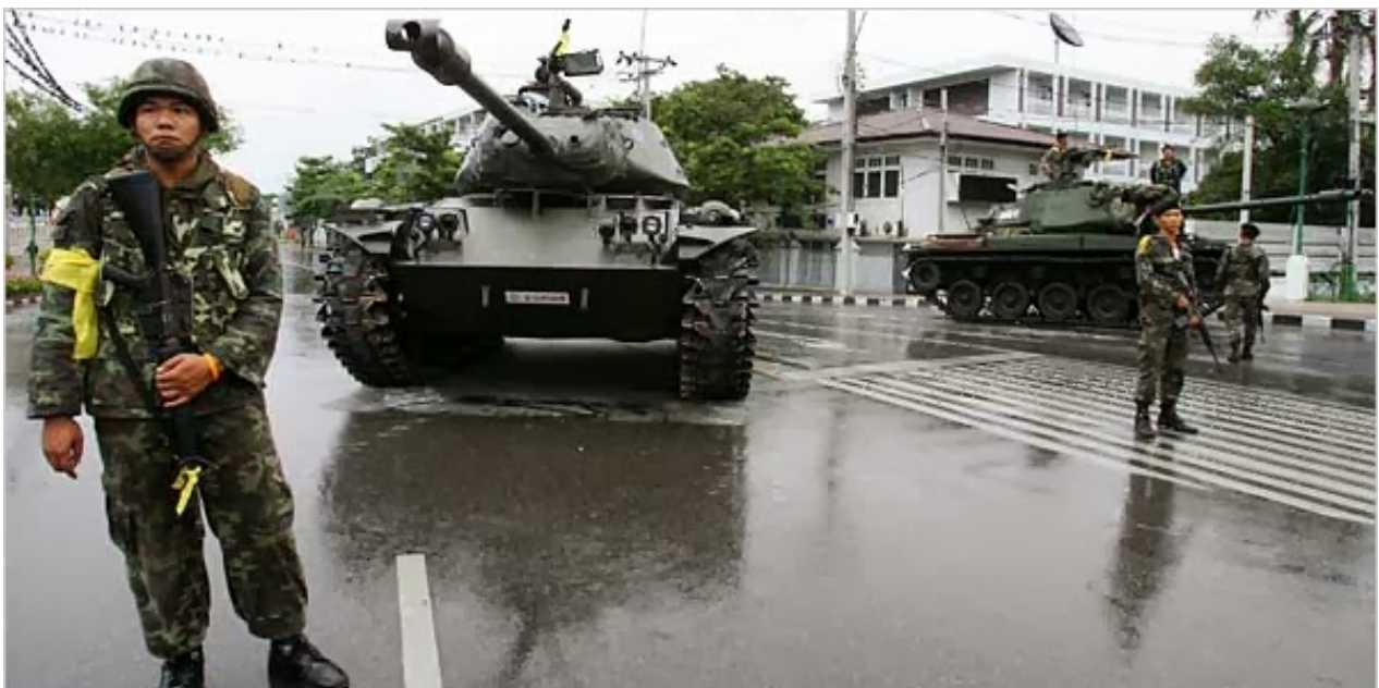
Image: Thailand’s military mobilized in 2006 to oust Wall Street-backed dictator Thaksin Shinawatra , who just the previous evening was sitting before the CFR giving his foreign sponsors a progress report. While the West attempts to portray the Thai military as “undemocratic,” the reality is the Thai army carried out what it was duty-bound to perform - the defense of Thailand against all enemies, foreign and domestic.

Despite years of the West attempting to cultivate close relationships with the Thai military through operations like the annual “Cobra Gold” exercise, Thailand’s brass appears to be cogent enough to value their freedom more than slick promises, funding, and vague enticements the West has made and then broken with so many nations before. Like the Egyptian and even Pakistani armies, they are more than willing to take funding, training, and weapons, and still carry on with an independent agenda.