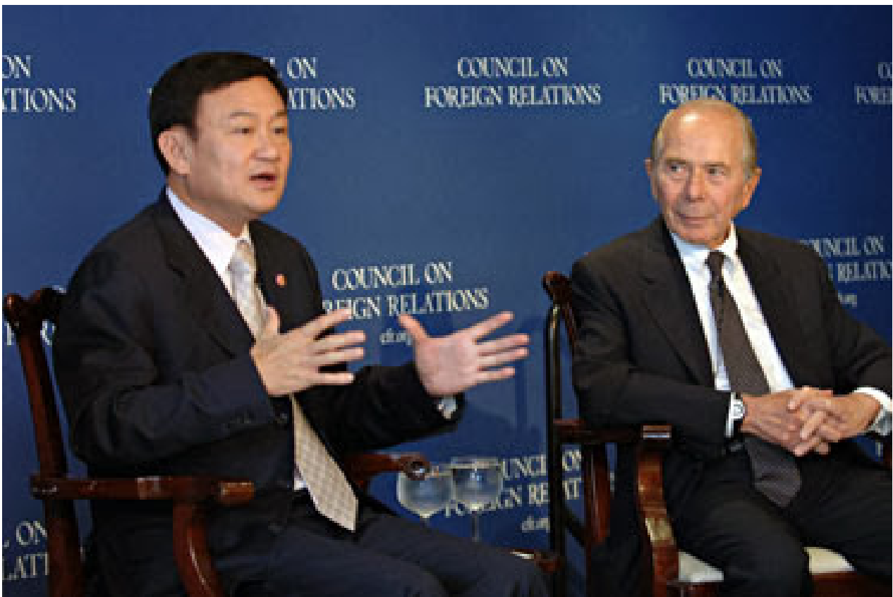
Photo: Deposed autocrat, Thaksin Shinawatra before the CFR on the even of the 2006 military coup that would oust him from power. Since 2006 he has had the full, unflinching support of Washington, Wall Street and their immense propaganda machine in his bid to seize back power.

In Thailand today, as the West's embattled proxy regime struggles to stay in power, the Western media is again aiming its rhetoric at the Thai military, attempting to preemptively shame it into standing on the sidelines. Of course, the West's media has lost significant statue in recent years, and attempts to shame the Thai military into inaction during a pivotal point in Thai history should be perceived both inside and beyond Thailand as negligible at best.