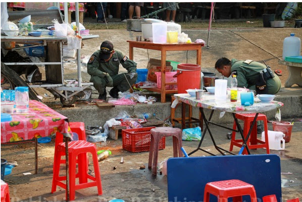
Image: Explosive Ordnance Disposal experts comb the aftermath of a pro-regime attack on protesters in the Thai province of Trat.

March marked the beginning of the sixth month of protests against the corrupt proxy government of Thaksin Shinawatra, the fugitive former prime minister of Thailand, who currently micro manages Thai government affairs through his youngest sister, Prime Minister Yingluck Shinawatra and the proxy Phuea Thai political party. He lives in Dubai, but frequently travels to the region around Thailand to give orders to his proxies.