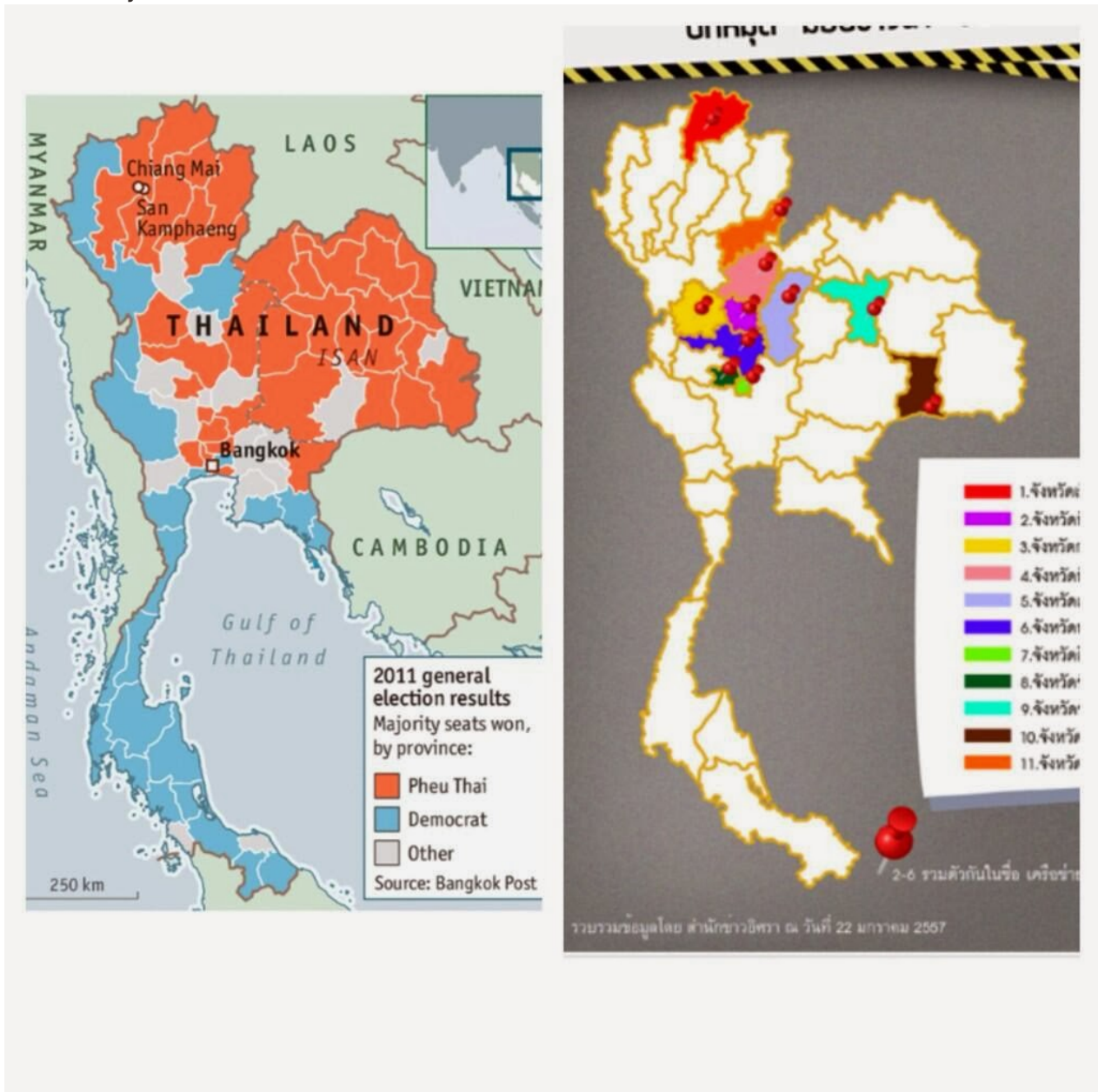
Image: (left) 2011’s election results showing most, but not all northern provinces under Thaksin Shinawatra’s proxy regime in red. (right) Provinces where rice farmers are now blocking roads in protest to Thaksin’s vote-buying rice scam that has collapsed in bankruptcy and scandal – dousing the absurd “secession” theory floated by the Economist and others.

For Thaksin Shinawatra and his proxy regime, it has only lost support since the 2010 survey was conducted. In the 2011 elections, despite being declared a “landslide victory,” according to Thailand’s Election Commission , Thaksin Shinawatra’s proxy political party received 15.7 million votes out of the estimated 32.5 million voter turnout (turnout of approx. 74%). This gave Thaksin’s proxy party a mere 48% of those who cast their votes on July 3rd (not even half), and out of all eligible voters, only a 35% mandate to actually “lead” the country.