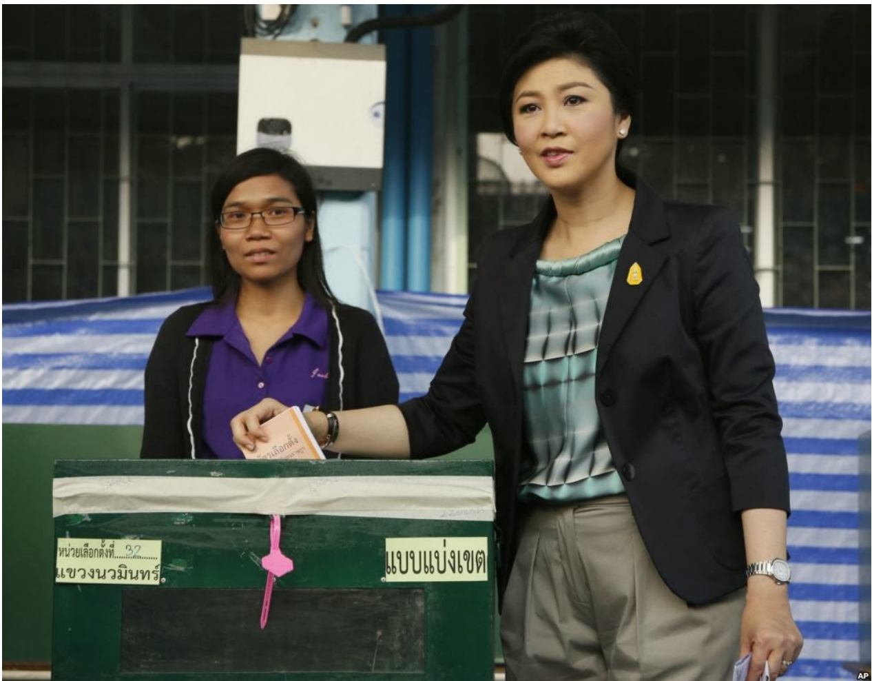
Image: Nepotist-appointed proxy PM Yingluck Shinawatra, sister of deposed dictator Thaksin Shinawatra would complete the humiliation of the regime’s sham elections February 2, 2014, by placing her ballot witlessly into the wrong box. She would then blame election officials for misdirecting her in yet another display of serial deferral of personal responsibility.

Less than half the nation bothers to vote at polling stations uninterrupted by protests indicating a vote of no confidence in both the current regime, or the so-called “democratic process” it presides over.