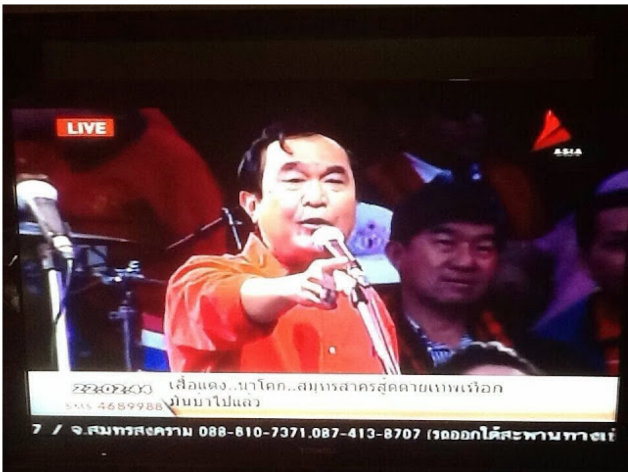
Image: The regime's Interior Minister, Jarupong Ruangsuan, takes to the stage the night their militants were released into the streets to begin firing on nearby protesting university students. Deaths have already been reported.

From Thursday night and into Friday morning, the regime's Interior Minister had taken the stage of the pro-regime rally, stirring up their mobs even as gunshots were fired and protesters were being killed, just beyond the walls of the stadium. Speakers took turns taking to the stage, with their colleagues smirking in the background, all while the foreign media began reporting on violence and deaths.