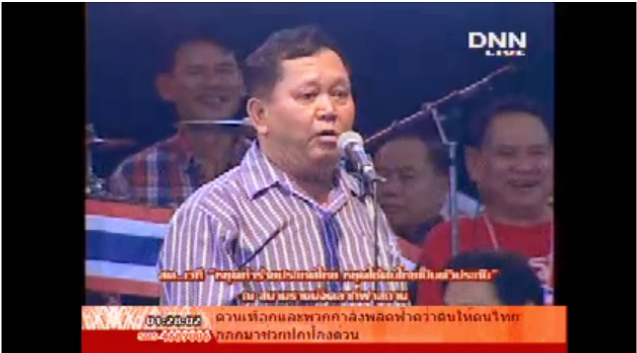
Image: At approximately 1:30am Bangkok, Thailand time, speakers take turns on stage speaking to a pro-regime rally held at Bangkok's Rajamangala Stadium while their colleagues behind them smirk and laugh – even as helicopters circle overhead and shots can be heard outside. This is after the first deaths have been reported across local and foreign news.

As of 2:30am local time, sporadic gunfire can still be heard, as well as louder individual explosions. Helicopters have intermittently flown overhead, and more deaths are in the process of being confirmed. When Bangkok awakens tomorrow, it will be to yet another Shinawatra prime minister with the blood of the Thai people on their hands.