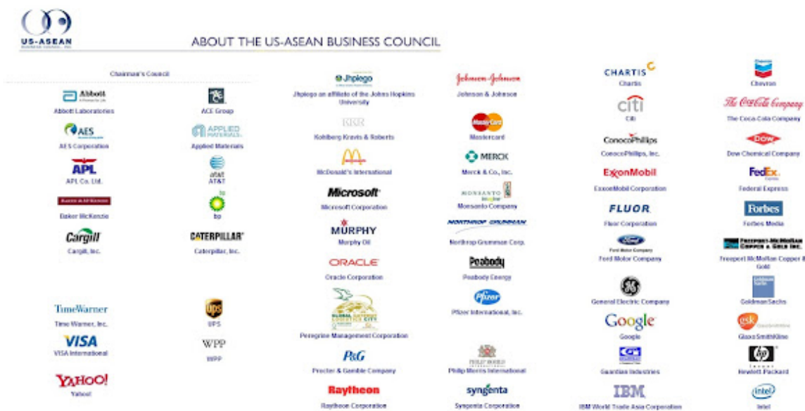
Image: The US-ASEAN Business Council , a who’s-who of corporate fascism in the US, had

In 2004, Thaksin attempted to ramrod through a US-Thailand Free-Trade Agreement (FTA) without parliamentary approval, backed by the US-ASEAN Business Council who just before last year’s 2011 elections that saw Thaksin’s sister Yingluck Shinawatra brought into power, hosted the leaders of Thaksin’s “red shirt” “United Front for Democracy against Dictatorship” (UDD) .