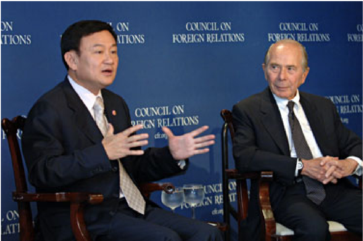
Photo: Deposed autocrat, Thaksin Shinawatra before the CFR on the eve of the 2006 military coup that would oust him from power. Since 2006 he has had the full, unflinching support of Washington, Wall Street and their immense propaganda machine in his bid to seize back power.

The council in 2004 included 3M, war profiteering Bechtel, Boeing, Cargill, Citigroup, General Electric, IBM, the notorious Monsanto, and currently also includes banking houses Goldman Sachs and JP Morgan, Lockheed Martin, Raytheon, Chevron, Exxon, BP, Glaxo Smith Kline, Merck, Northrop Grumman, Monsanto's GMO doppelganger Syngenta, as well as Phillip Morris.