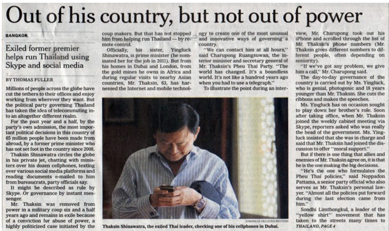
Image: The New York Times openly admits that Thailand is currently run by unelected convicted criminal/fugitive Thaksin Shinawatra. Clearly any proxy government or elections in

Both Forbes and the New York Times published direct quotes from the ruling party’s leadership inside of Thailand, and from Thaksin Shianwatra himself, declaring that he was ruling the country remotely.