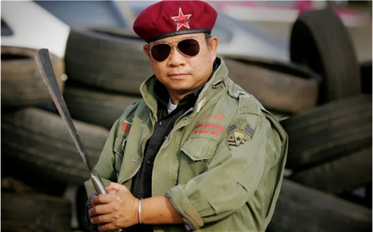
Image: Thaksin Shinawatra's "red shirts" want to "purge the elite" – however, constituting less than 7% of the population, and backed by Wall Street, this conspiracy to commit mass murder looks more like yet another Libya or Syria-style proxy war being waged by Wall Street and London against yet another sovereign nation.