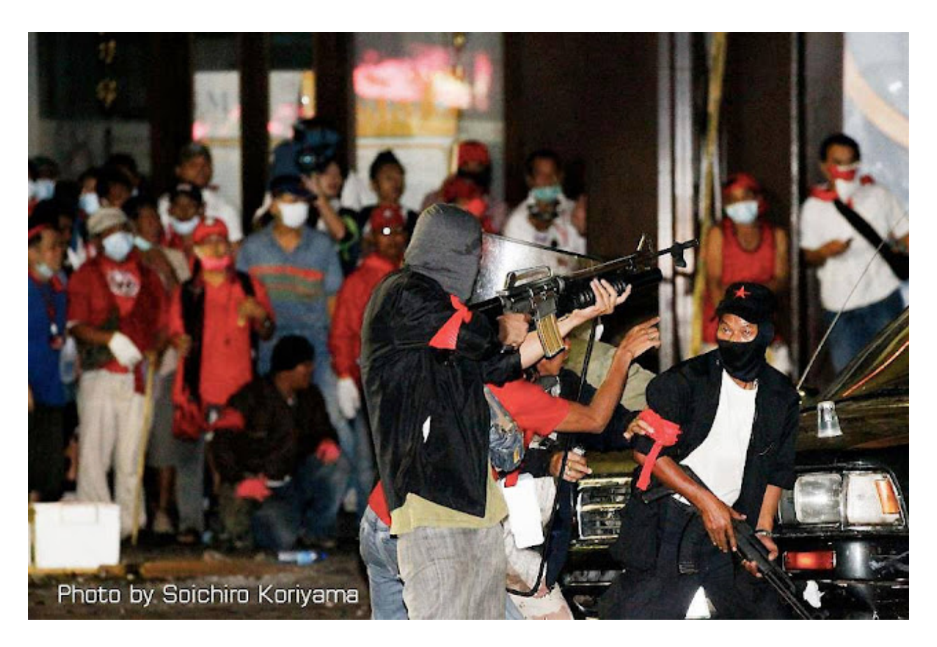
Image: Thailand has gotten its own taste of US-backed terrorism when in 2010 US-proxy Thaksin Shinawatra fielded an army of some 300 terrorists who engaged in gun battles over the course of weeks, killing nearly 100 and ending in a campaign of city-wide arson.

Thailand's decision to no longer allow Thai territory to be used in trafficking Uighur agitators, terrorists, and political provocateurs has resulted in the immediate attack on their consulate in Turkey, and likely to further covert destabilization within Thailand itself. Recent ties between China and Thailand have been growing stronger, manifesting themselves in a variety of immense, joint infrastructure projects as well as a potential, lucrative submarine purchase by Thailand's Royal Navy.For Thais, it is essential that they understand that US meddling in Thailand's internal affairs goes far beyond the traitors and sedition fueled by torrents of political, financial, and even operational support from overseas within their borders. It also includes the role the US attempts to use Thailand in to facilitate its agenda abroad – most importantly in destabilizing China, but also as far as supporting US-backed terrorism in the Middle East.