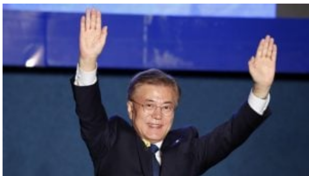
President Moon Jae-in