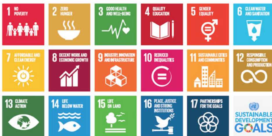
Diagram listing the goals of Agenda 2030, an update to Agenda 21