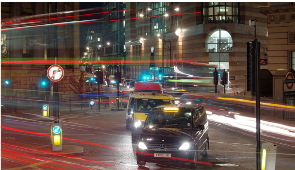
Traffic at an intersection in the City of London