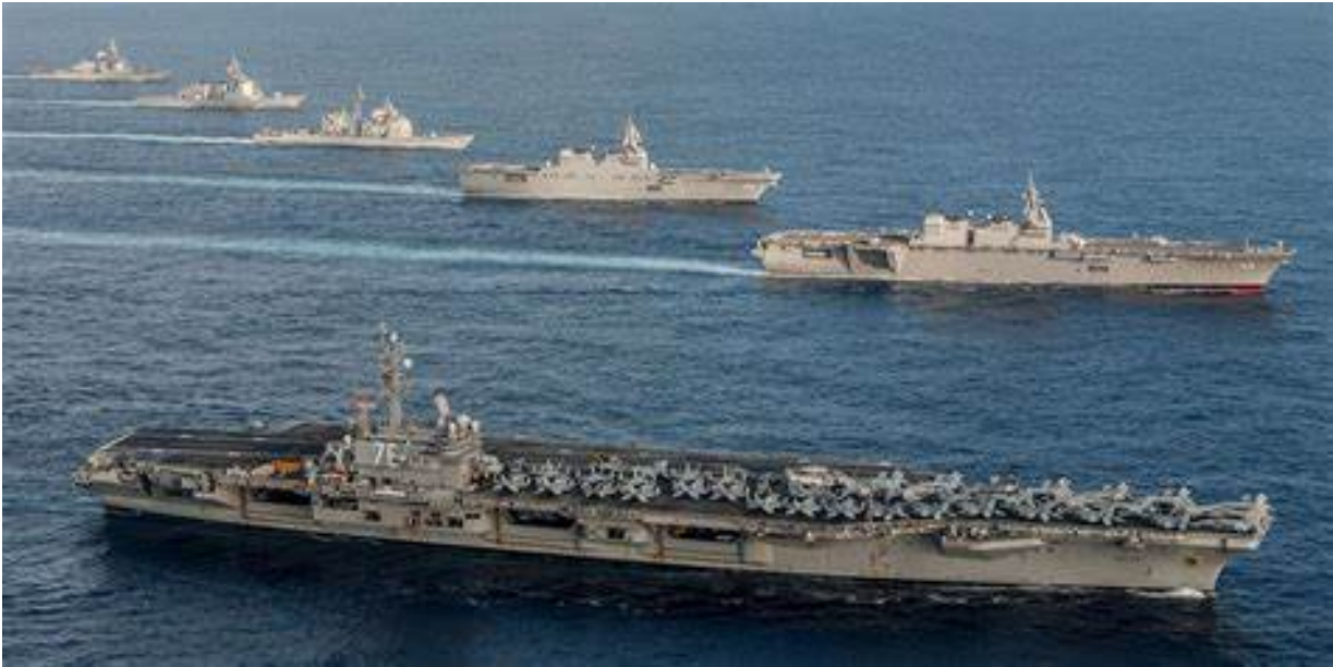
U.S. Pacific Fleet.

China condemned these arrogant displays of U.S. military power as reckless, provocative and meant to apply pressure.