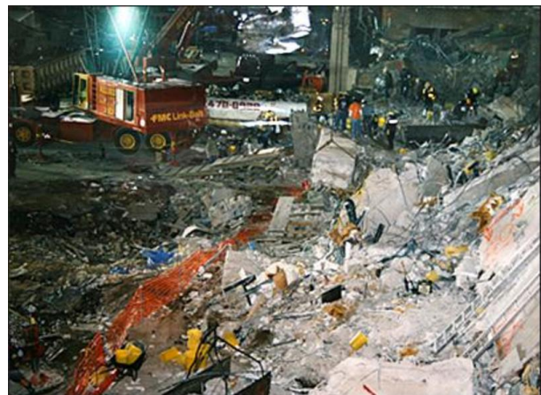
First World Trade Center bombing of 1993

Many have forgotten that there was a Phase One-Phase Two process with respect to 4/19 as well. Both immediately and thereafter there were a number of reports linking McVeigh and Nichols to Iraqis and other Middle Easterners, including Ramzi Yousef, the fugitive bomber in the 1993 World Trade Center bombing (which also used an ammonium nitrate (ANFO) bomb in a Ryder rental truck.) 29 Both Clinton and his Counterterrorism Coordinator, Richard Clarke, have confirmed that some of these stories were discussed at a meeting of the Counterterrorism Security Group on the day of 4/19. 30 Both men also claim to have dismissed them in favor of a low-grade Phase Two local conspiracy led by the two designated culprits: Timothy McVeigh and Terry Nichols. But reports of Middle Eastern involvement, sometimes attributed to sources inside government, continued to appear in the governing media, including CBS, NBC, and the New York Times . 31