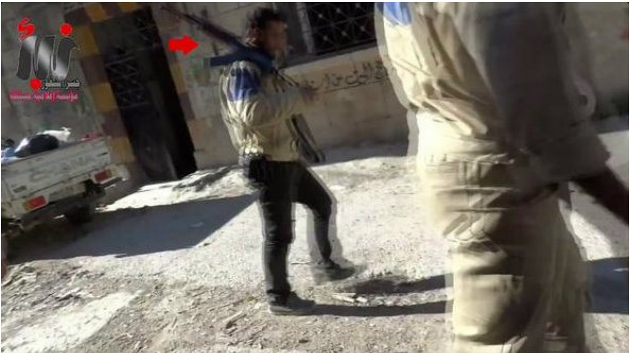
ARMED: Screenshot from video shot in Aleppo clearly showing White Helmet members automatic combat rifles.

Video clearly showing armed White Helmets on the streets of Aleppo: