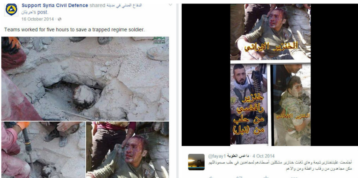
Above: on the left hand side is a post dated Oct 16, 2014 from the Syrian Civil Defense Facebook page , the White Helmet ‘rescue’ version , while the right hand side is from an earlier Oct 4, 2014 Twitter post shows Al Nusra Front’s likely ‘execution’ version of the same event.

captured by Al Nusra terrorists 10 days previously. In the Al Nusra version, this soldier is described as a “Shia pig” and was most probably summarily executed as an apostate according to Wahabi doctrine. Hard to imagine how the White Helmets then rescued him, unless of course they dug up his body for publicity purposes.”