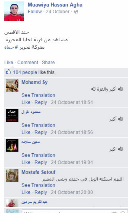
DISTURBING: Muawiya Hassan Agha Facebook page on 24/10/2015 shows the celebrating the death of a Syrian Army soldier.

A very cursory scroll down Agha’s Facebook page also reveals very recent photos of SAA corpses accompanied by a number of celebratory, albeit disturbing comments.