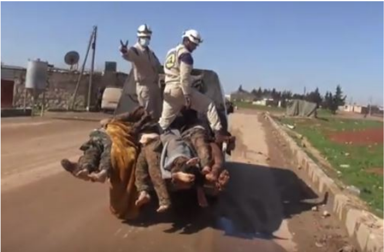
VIDEO STILL: 'Neutral' White Helmet operatives flash the victory sign as they cart off dead Syrian Army corpses.

Moving on to another video, this time revealing White Helmet operatives standing on the discarded dead bodies of SAA [Syrian Arab Army] soldiers and giving the victory sign. This display of support for the Al Nusra extremist terrorists who have just massacred these soldiers once again demonstrates where their true allegiances lie. Watch here: