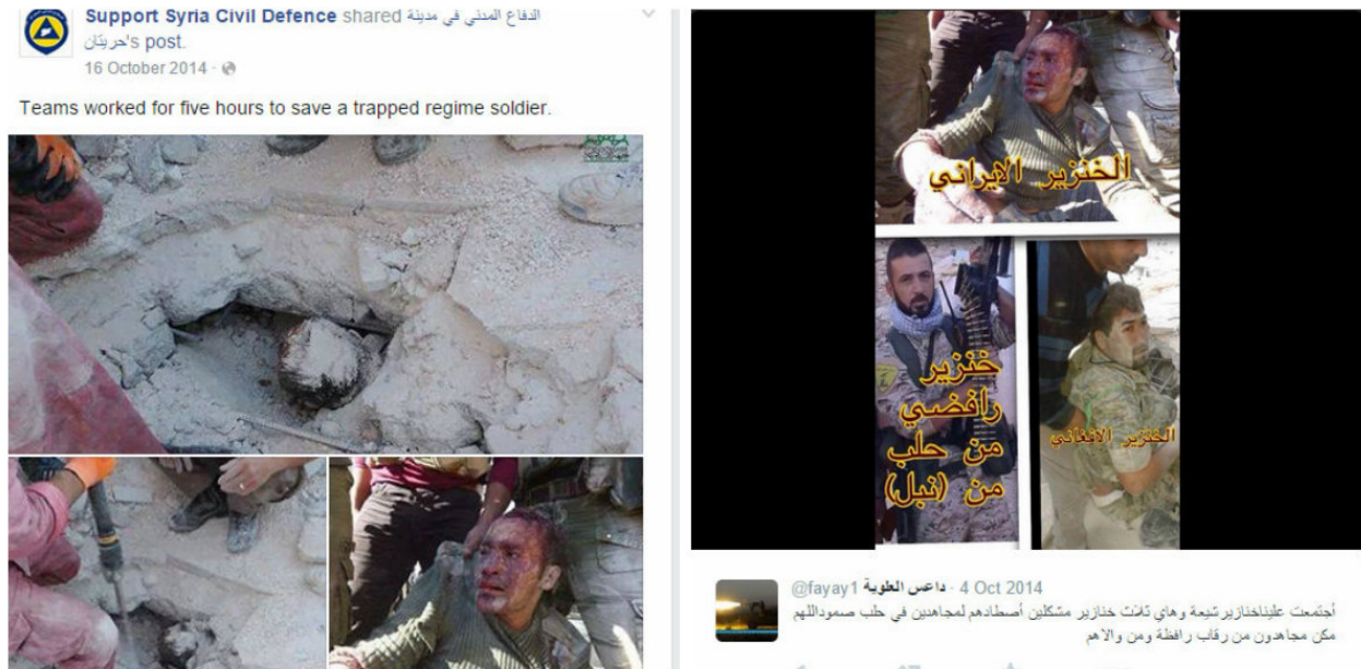
Above: on the left hand side is a post dated Oct 16, 2014 from the Syrian Civil Defense Facebook page , the White Helmet ‘rescue’ version , while the right hand side is from an earlier Oct 4, 2014 Twitter post shows Al Nusra Front’s likely ‘execution’ version of the same event.

reality been captured by Al Nusra terrorists 10 days previously. In the Al Nusra version, this soldier is described as a “Shia pig” and was most probably summarily executed as an apostate according to Wahabi doctrine. Hard to imagine how the White Helmets then rescued him, unless of course they dug up his body for publicity purposes.”