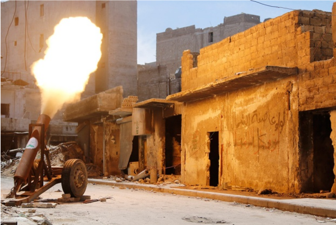
'Moderate' rebel Hell Cannon, in Aleppo.

that it's full with explosives?... Yet, the media is busy with the legendary weapon of "barrel bombs"! They came to spread "freedom" among Syrians! How dare they say that Syrian army shouldn't fight them back?" ~ from Syria, welcome to Hell.