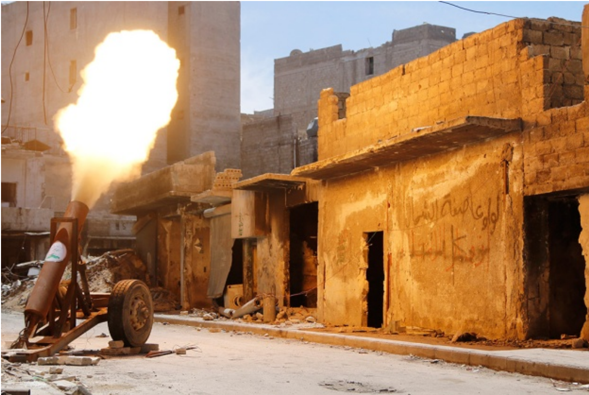
'Moderate' rebel Hell Cannon, in Aleppo.

Syrians! How dare they say that Syrian army shouldn't fight them back?" ~ from Syria, welcome to Hell.