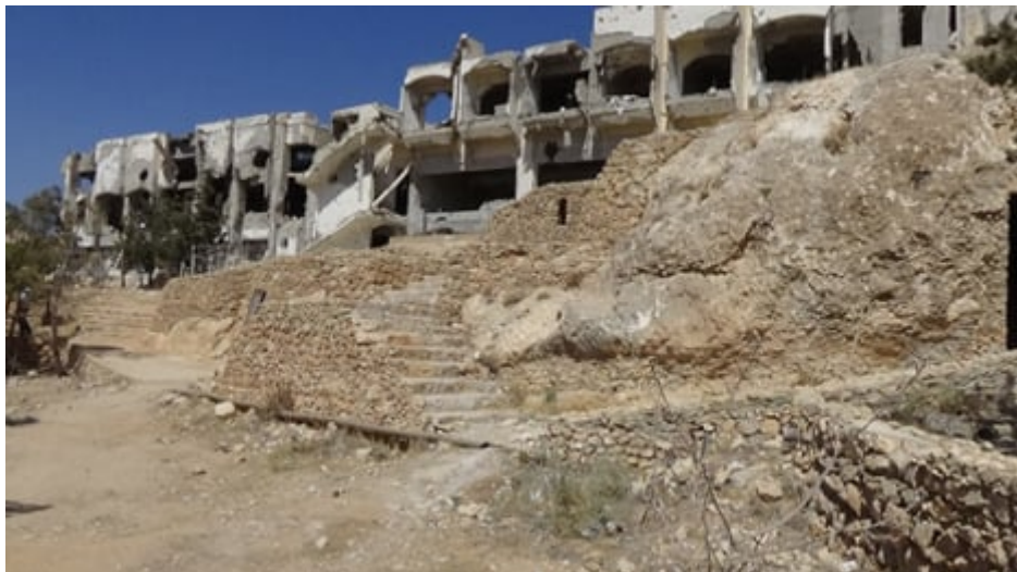
Former al Nusra Front Headquarters, Maaloula, Syria