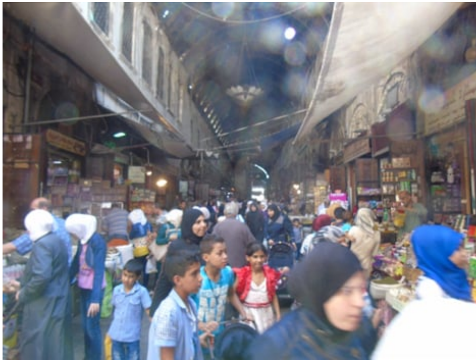
Tentacles of predatory neoliberal capitalism have yet to invade Syria's famous souks/markets