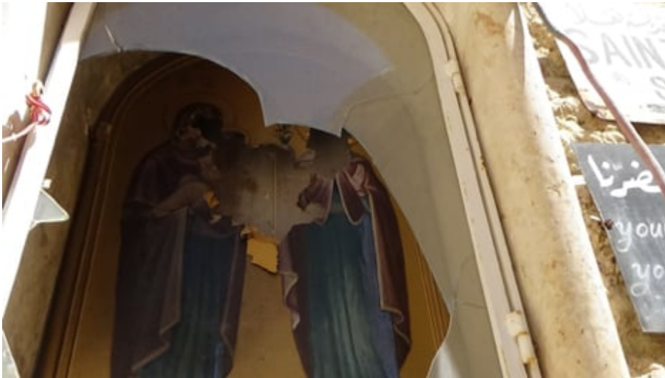
Terrorist-damaged religious iconography at Maaloula, Syria

The terrorists did invade this ancient and holy place, they did destroy religious icons, and they did kill many people.