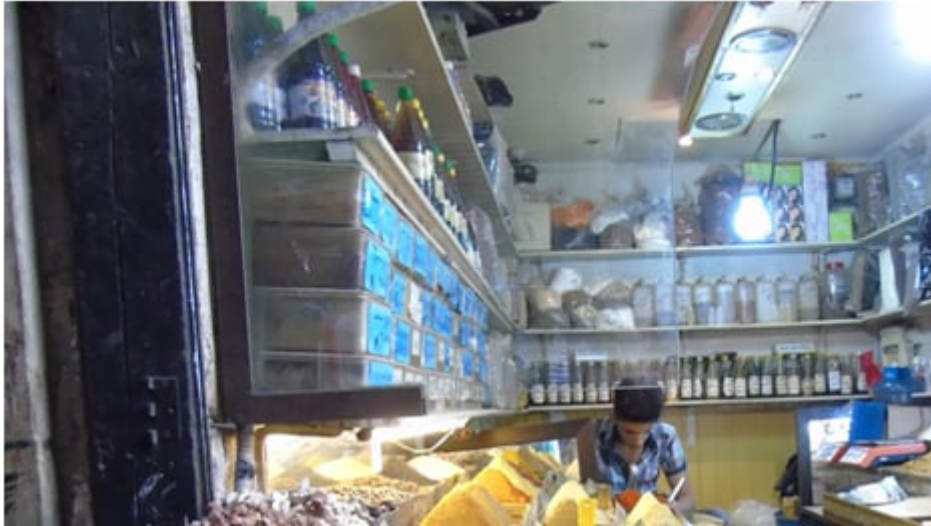
Spices at the Souk

False flag terrorism is part of the apparatus of deception which serves to advance policies that are contrary to the wishes of those who are deceived.