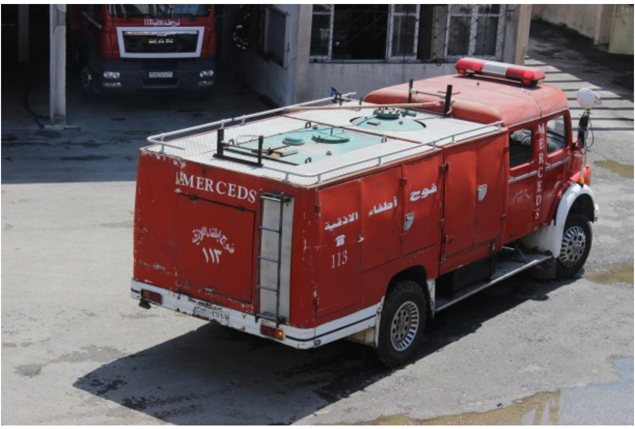
Latakia Fire Brigade centre, Latakia. Syria August 2016.

Part II of the series on the REAL Syria Civil Defence will be published at 21st Century Wire very shortly.