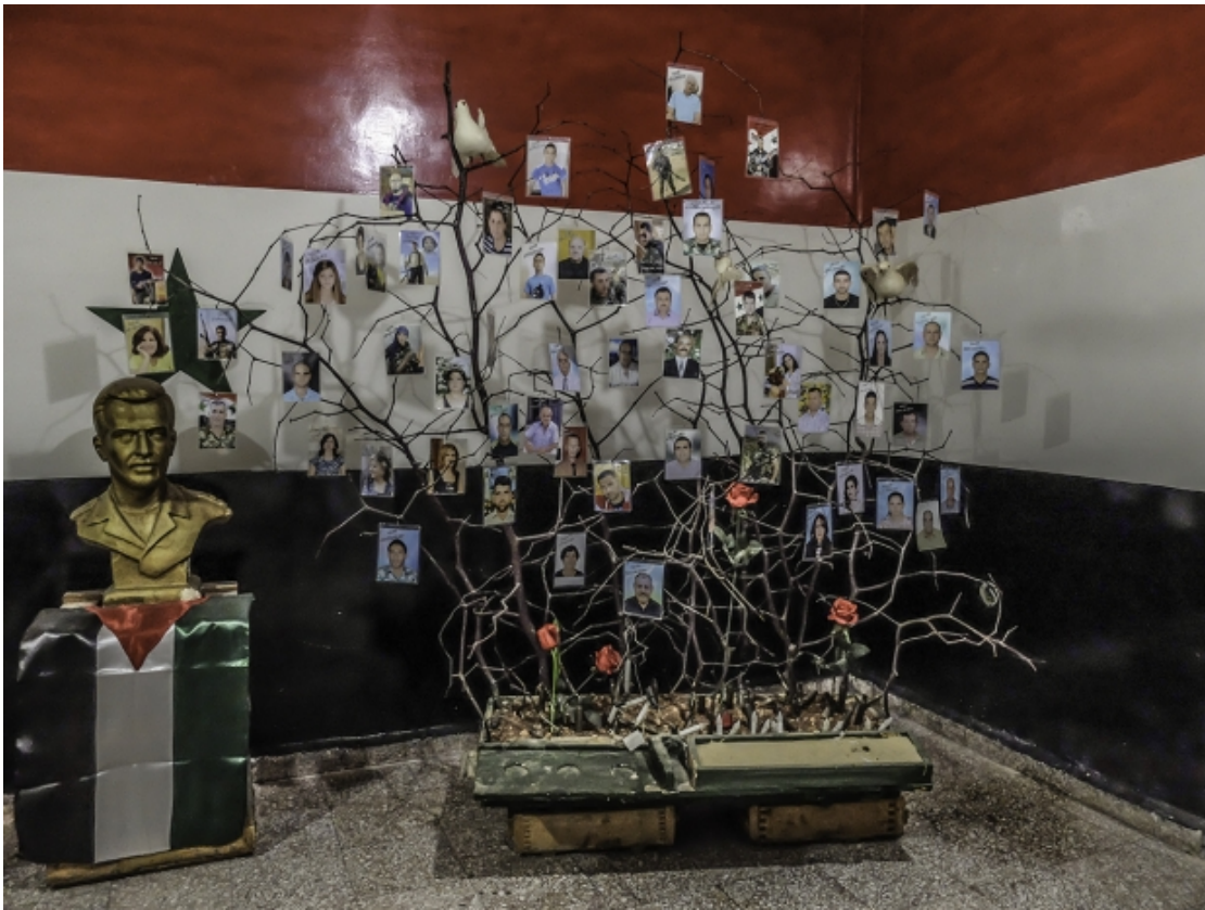
Honouring some of Mhardeh residents killed during in the war

While morale in Mhardeh remains strong, Syria's civil war and international sanctions have sent prices of most goods rocketing, and life remains tough. Every week, the Red Crescent in charge of distributing UN-supplied aid, is inundated by residents collecting boxes of essential foodstuffs.