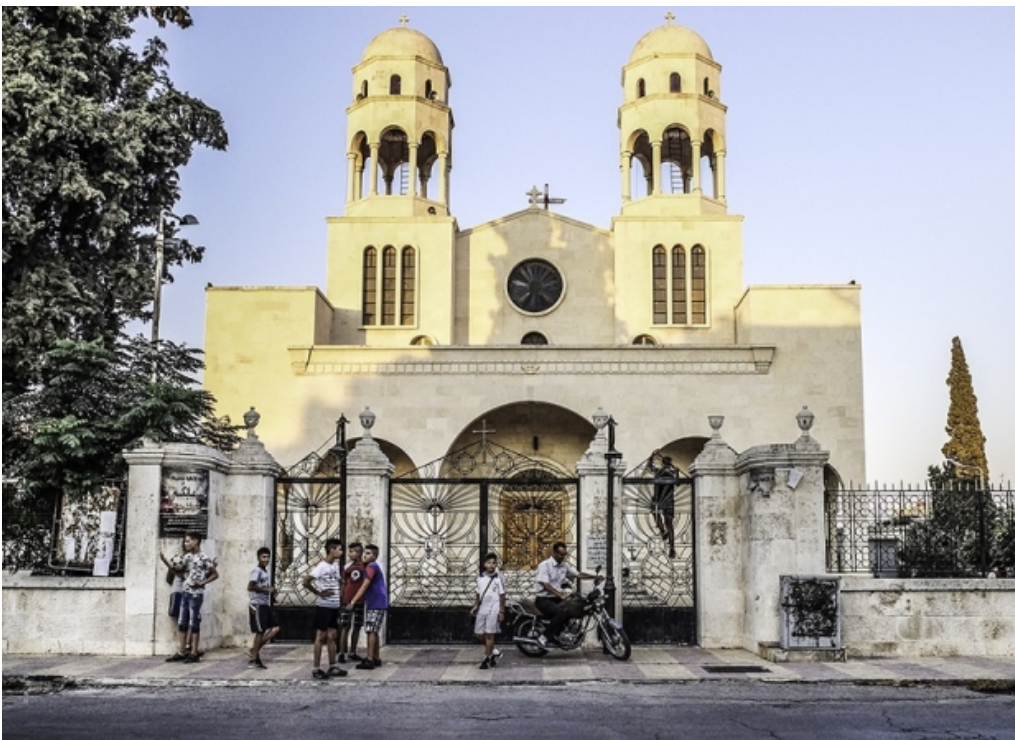
One of four churches in Mhardeh