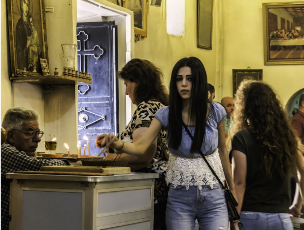
Christians light candles in one of Mhardeh's four churches

Wakil, injured himself nine times, gestures around the room, saying every man present has been injured in fighting and most have gone straight back to the front lines after treatment.