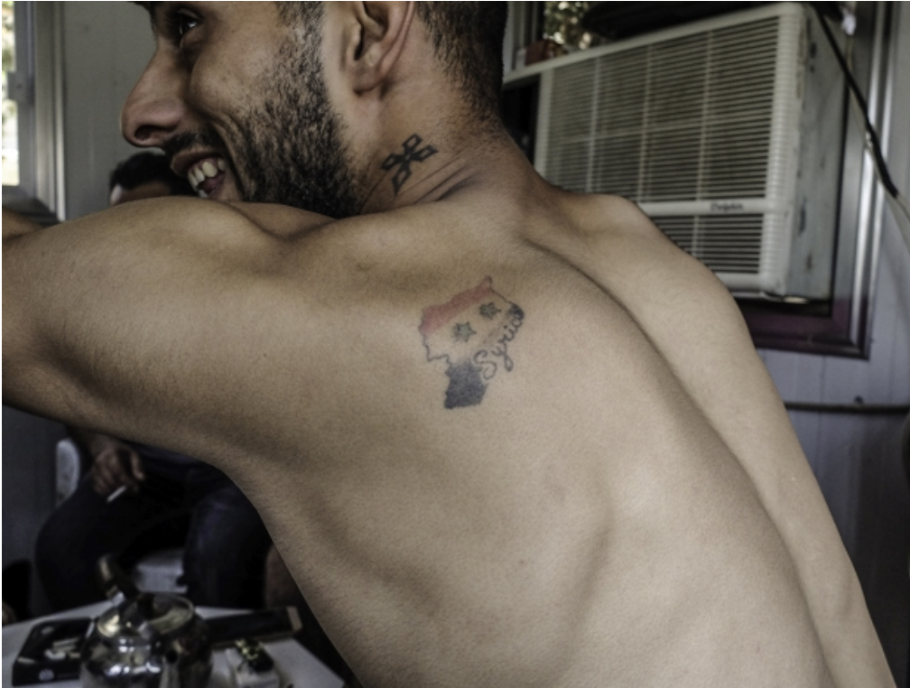
Religious and patriotic tattoos on a Mhardeh Defence Force fighter