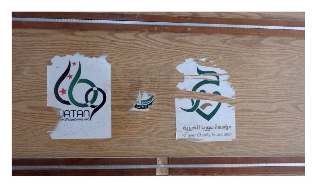
Inside the al-Quds hospital, two Norwegian-supported associations which offer support solely to al-Qaeda and affiliates' occupied areas of Syria.

NORWAC <u>openly declares its support</u> of the two organizations that are based solely in areas controlled by al-Qaeda and other terrorist groups. WATAN's lofty self-description includes being a "nonpolitical and nonsectarian organization" and having the mission to develop "a sustainable, healthy and educated community, based on inclusive society that positively engages, supports and improves the lives of each individual, regardless of their gender, faith or ethnicity." The fact, however, that <u>they work with al-Qaeda and other extremist</u> Islamists, which actively attack people of non-Muslim faith and oppress women, speaks the less lofty truth about WATAN's concern for Syrians.