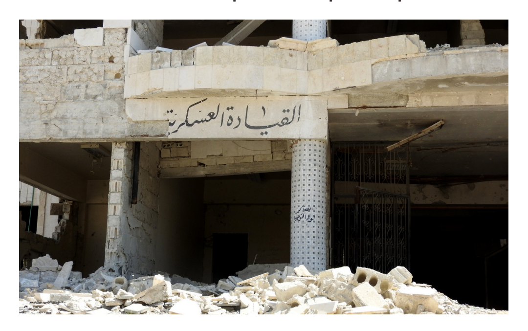
A building in the Eye Hospital complex which was used by the Liwa Tawhid brigade as a headquarters, Aleppo Syria, June, 2017.

In November 2016, <u>descending several levels underground</u> in an area of Lairamoun that had been controlled by the CIA armed and funded Free Syrian Army's 16th Brigade, I saw the rooms that had been used as prisons by the FSA, as well as narrow, concrete and metal solitary-confinement cells.