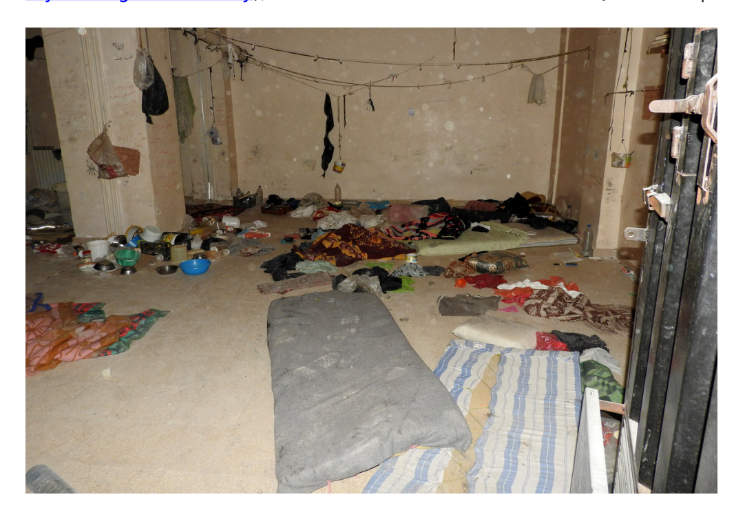
A room used to imprison tens of civilians in the underground prison in the Eye Hospital complex, Aleppo Syria, June, 2017.