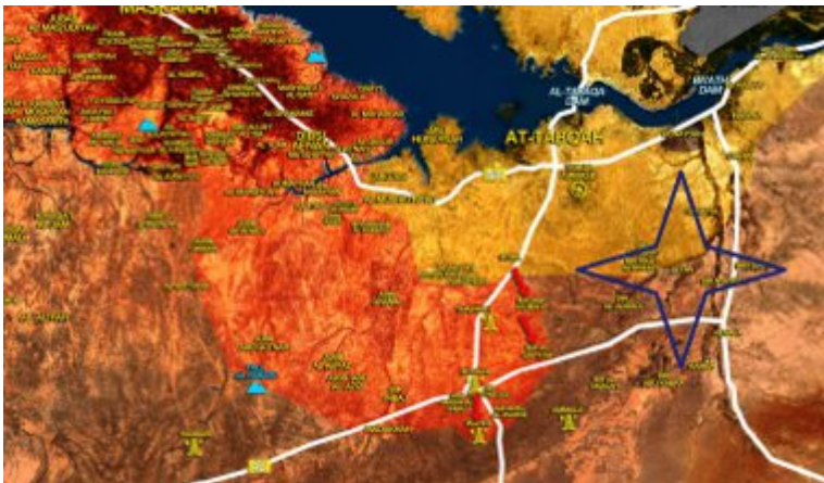
see bigger picture here

Raqqa is currently besieged by the U.S. supported Kurdish forces of the SDF. Those forces (yellow) have taken parts of the southern bank of the Euphrates around the city of Tabqa. The Syrian army is moving to the south of these forces from west towards the east. Its current target is the town of Resafa at the crossing of road 6 and road 42. If it takes the crossing it can move south-east along the major roads towards Deir Ezzor. It will also cut off a retreat route for Islamic State forces who are fleeing south to escape the Kurdish Raqqa attack. The distance to go to Deir Ezzor is about 100 kilometer and there are no major impediments along the way. Taking the crossing is immensely important for the relieve operation of the besieged eastern city.