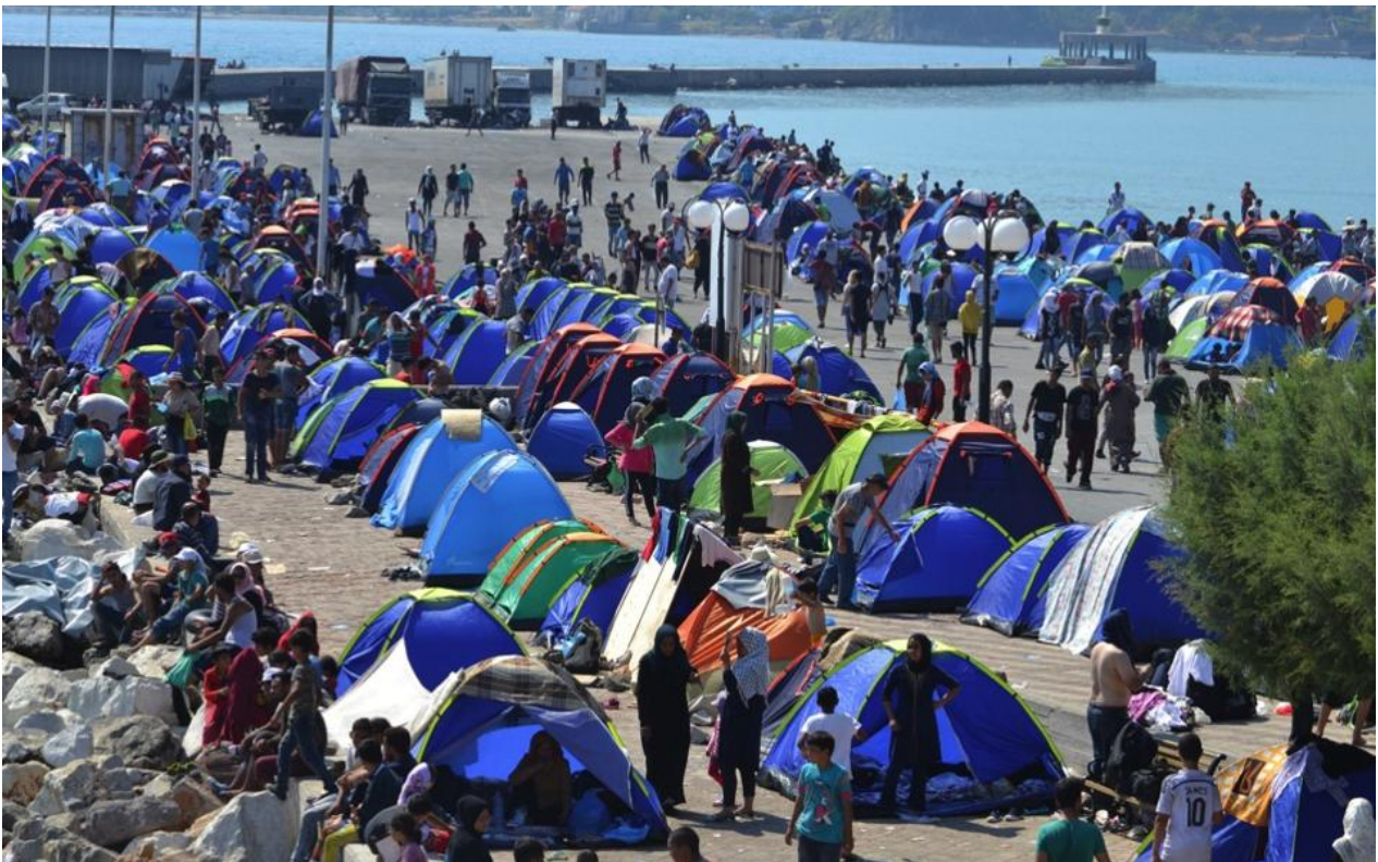
Lesvos Refugee Camp

All of the above groups have worked hand in glove, for many years, with the banned terrorist group Jabhat al Nusra, while the SSUK Facebook site opposes Iraqi Government and Syrian Government bombing of ISIS strongholds in Raqqa and Fallujah. According to the British SSUK, Arab Governments cannot fight banned terrorist organisations in their own countries. This is much the same line as Washington.