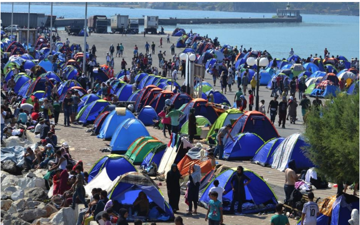
Lesvos Refugee Camp

All of the above groups have worked hand in glove, for many years, with the banned terrorist group Jabhat al Nusra, while the SSUK Facebook site opposes Iraqi Government and Syrian Government bombing of ISIS strongholds in Raqqa and Fallujah. According to the British SSUK, Arab Governments cannot fight banned terrorist organisations in their own countries. This is much the same line as Washington.