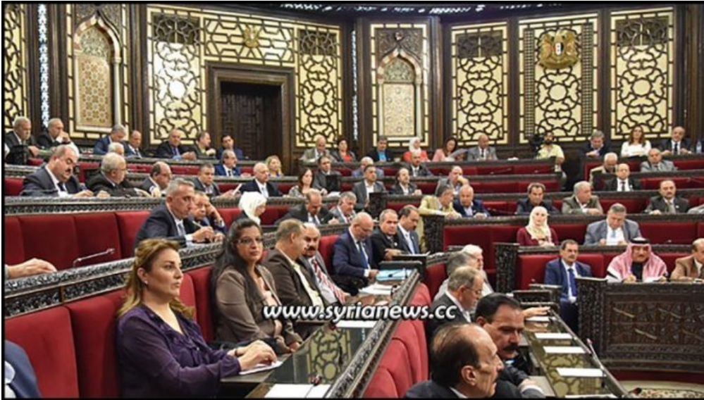
Syrian Parliament - Damascus

Syria prides itself on offering top education standards for free and almost free from pre-school all the way up to Ph.D. in all topics and fully covered scholarships abroad, even during the current crisis . Syrian graduates outperform their peers whenever and wherever given the chance to excel.