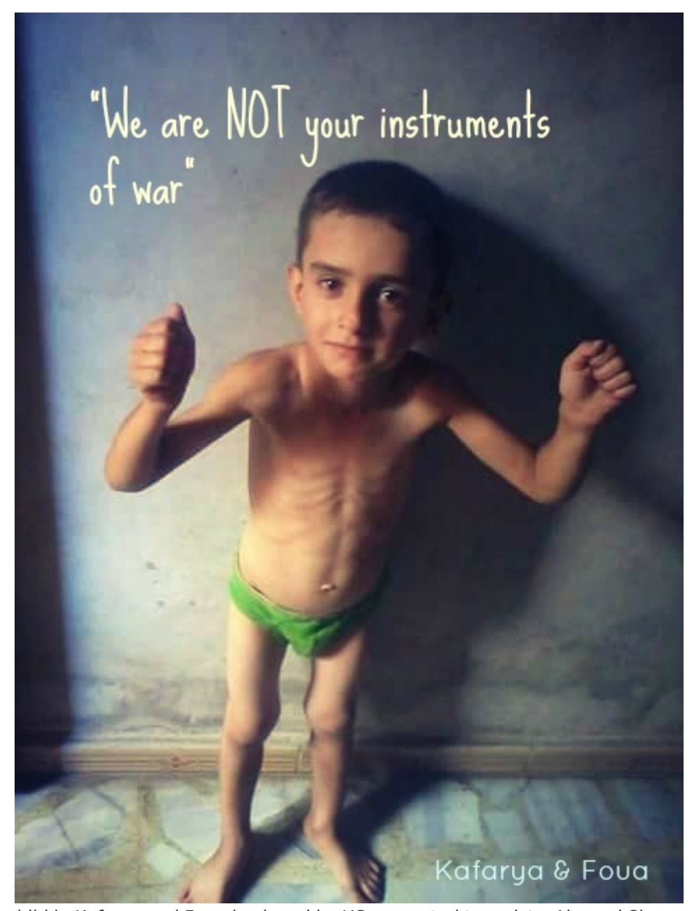
Starving child in Kafarya and Foua besieged by US supported terrorists, Ahrar al Sham and Nusra Front.

The original source of this article is <u>21st Century</u> Copyright © <u>Vanessa Beeley</u>, <u>21st Century</u>, 2016