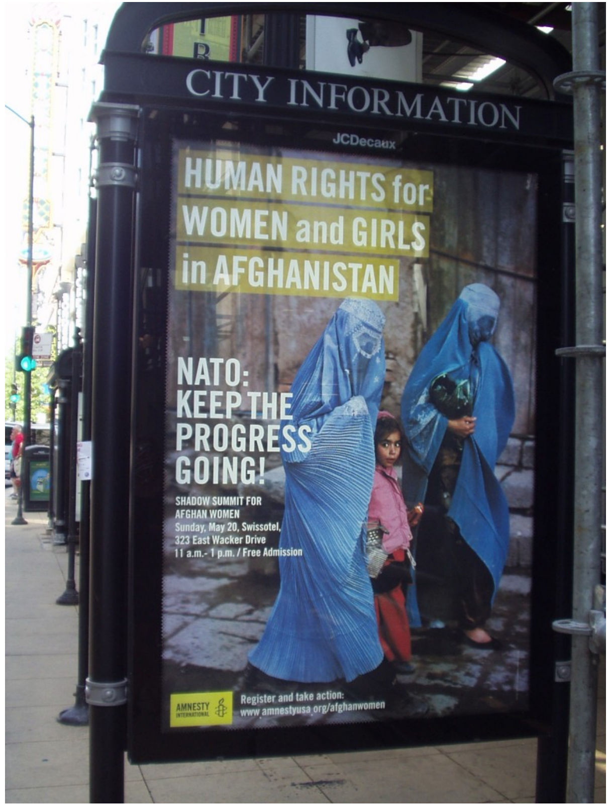
The infamous Amnesty International 2012 campaign: "<u>Human Rights for Women and Girls in Afghanistan" and "NATO: Keep the Progress Going!</u>

Read more on the NGO complex and its role in de-stablizing nations prior to and during US, NATO state illegal interventions in this 21st Century Wire article: <u>An Introduction: Smart Power and the Human Rights Industrial Complex</u>