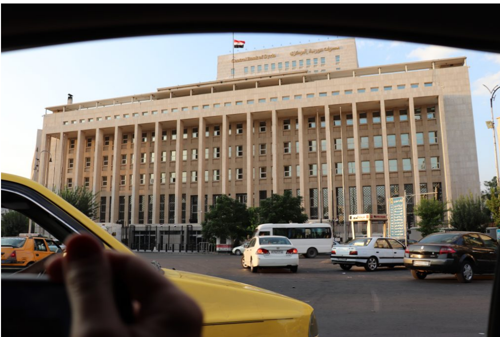
Central Bank of Syria

However, Syria still has its own public Central Bank, which promises a free and self-determining political economy. Reportedly, even now, Syria has no external debts.