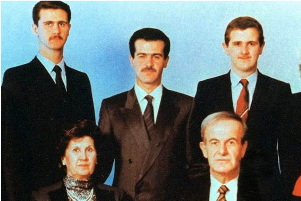
Assad family in 1980s. Hafez in lower right and Bashar on left.

Further, salaries increased by 300 percent under Assad's rule, thousands of new businesses sprung up, agricultural and industrial capacity increased, the illiteracy rate was kept low, and the unemployment rate declined from 28 to 12 percent.