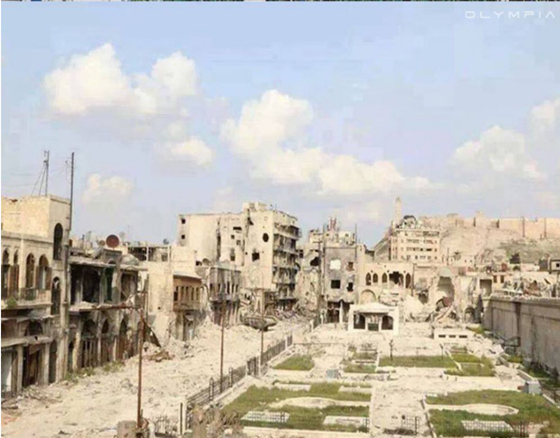
Syrian city of Aleppo before and after U.S.-backed war of aggression on Syria.