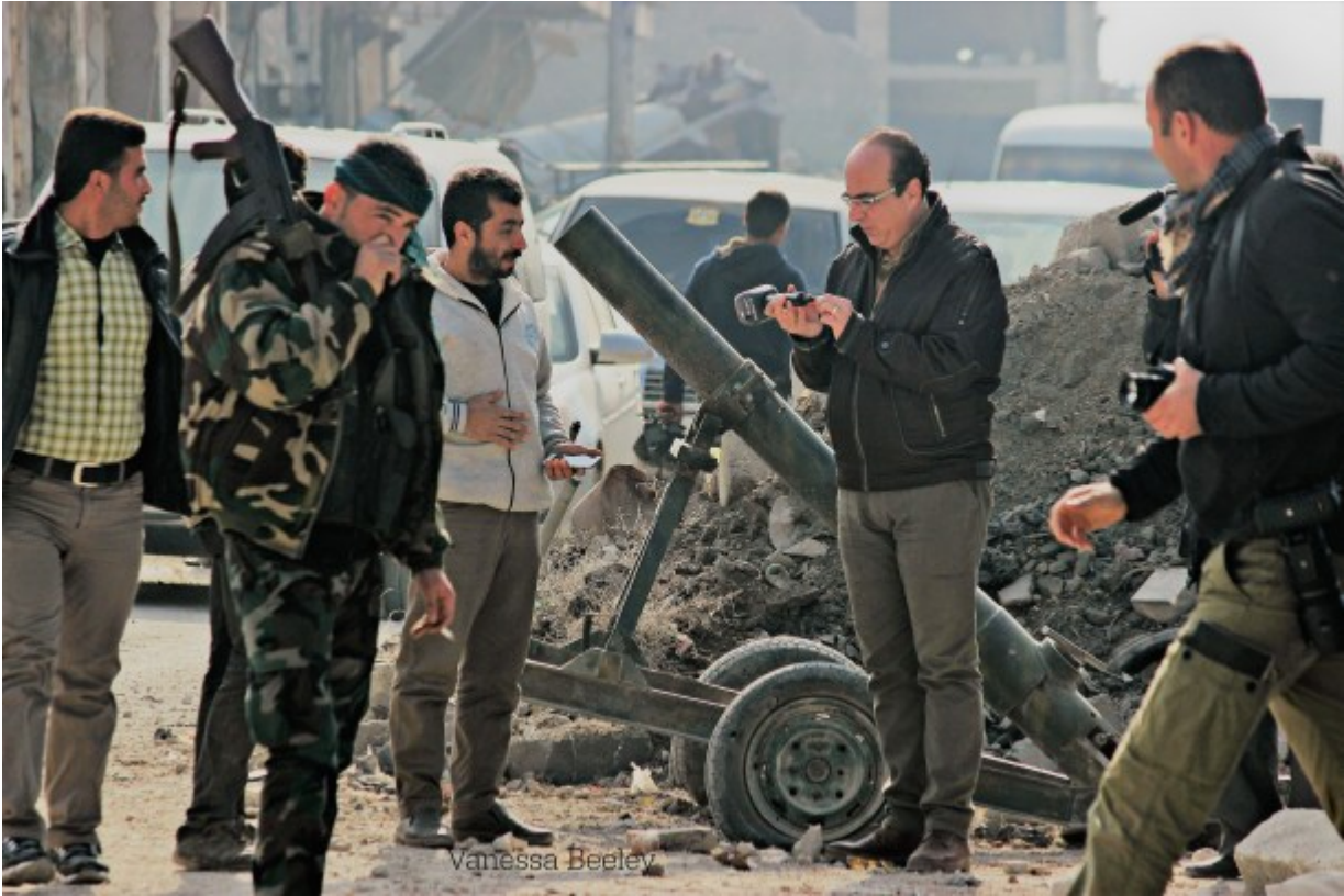
Nusra Front Hell Cannon, captured in Sheikh Saeed, East Aleppo. 12/12/2016.