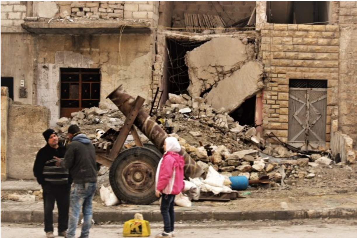
Nusra Front Hell Cannon, captured in Sukare, East Aleppo. 24/12/2016.

No mention is made by this media-propaganda juggernaut of the 11,000 recorded and