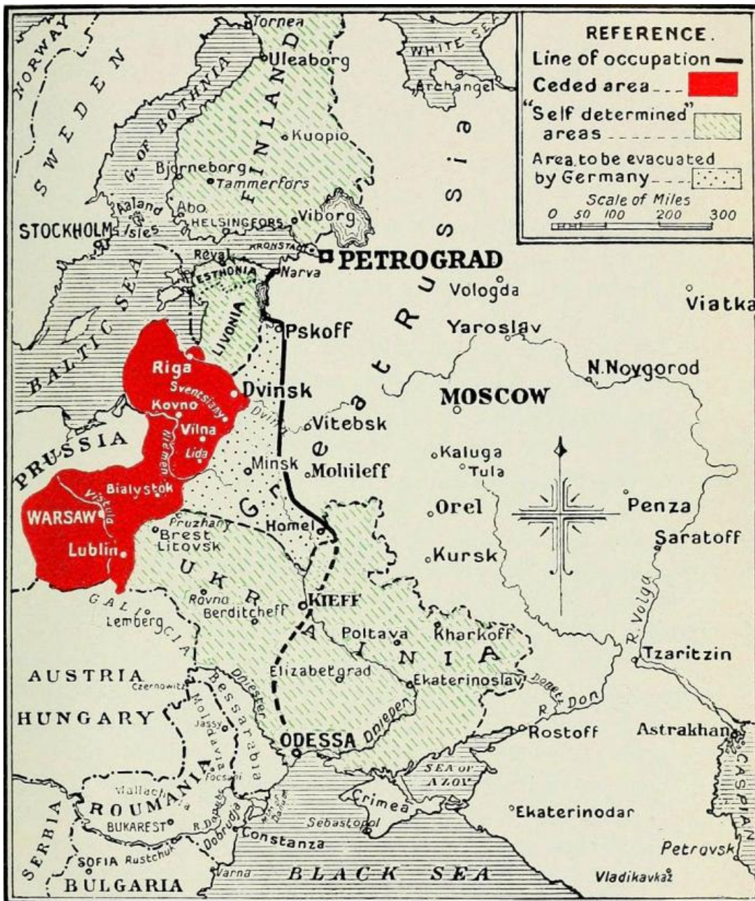
Borders drawn up in 1918 Treaty of Brest-Litovsk.

And what is the tragedy of the execution of the Romanov family compared to the millions of Russian peasants who Nicholas II sent to their deaths in World War I? Putin seems to forget that the needless imperial bloodbath was what propelled the success of the Russian Revolution to begin with. The reigning Russian leader is also just as seemingly unaware that Lenin did not reject Russian nationalism outright as the mainstream Left critics of his speech. To distinguish Soviet patriotism from the reactionary monarchist Black Hundreds, Lenin wrote in On the National Pride of the Great Russians :