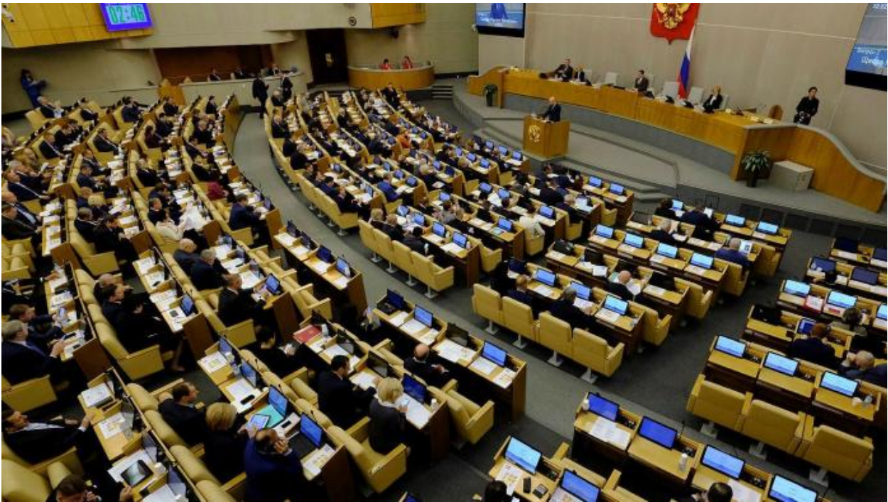
Russian Parliament in process of voting to approve recognition of Luhansk and Donetsk Republics—something first proposed by the Russian communists.

It is impossible to understand the struggle between the two countries and the Left's misapprehension without putting it in the context of the former Soviet Union and its demise. Leaving aside his own politics, Putin's assertion that the Bolsheviks carved up territory of the former Russian Empire to form a Ukrainian state is a historical fact.