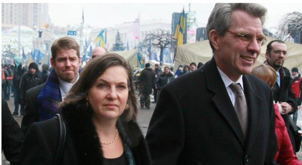
Victoria Nuland and Geoffrey Pyatt: “Fuck the EU.”

Immediately, Western-backed mass protests in the so-called “Revolution of Dignity” began and within months he was removed in a parliamentary coup with Washington strategists handpicking his replacement. When it turned out that Brussels [EU] preferred the former professional boxer and current Mayor of Kyiv Vitali Klitschko to be his successor—instead of the U.S.'s choice—it was revealed in a controversial leaked phone call that Victoria Nuland, Assistant Secretary of State for European and Eurasian Affairs, told U.S. Ambassador to Ukraine Geoffrey Pyatt, “ Fuck the EU. ”