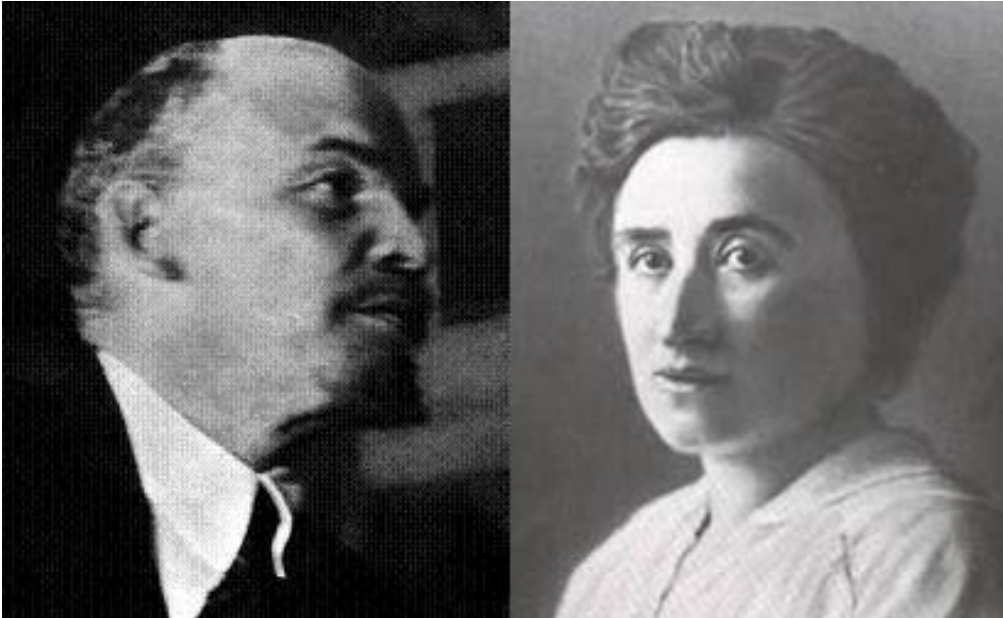
Vladimir Lenin, left, Rosa Luxemburg, right.

Lenin disagreed and upheld the position that the right to sovereignty should be unconditional, even if reactionary forces were to take power. Upon Moscow's exit from World War I, the Baltic states gained their first period of independence and the Finnish Civil War resulted in a Red defeat.