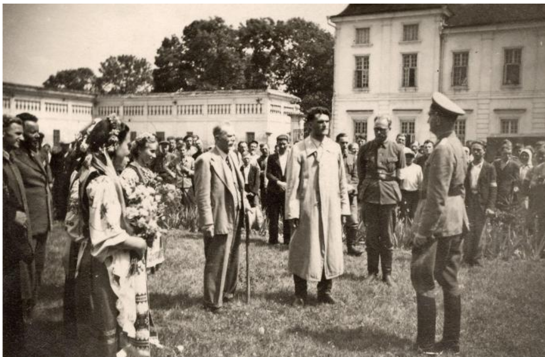
Ukrainians greet German soldiers in western Ukraine in 1941.

In retrospect, whether or not Lenin's stance was correct and Luxemburg's wrong is a matter of debate, though the consensus seems to be the former on the left, particularly when applied to the many anti-colonial and national liberation struggles in the global south. So too is the matter of whether Ukraine had the right to become a separate country from Russia, albeit both Eastern Slavic nations along with Belarus evolved from the medieval Kievan Rus state and they are essentially the same ethnic group. Nevertheless, what is more pertinent is that Luxemburg was ominously accurate in her assessment of the particularly dangerous character of Ukrainian nationalism. After all, Lenin died in 1924 and did not live to witness the Great Patriotic War and Ukrainian collaboration with the Axis powers.