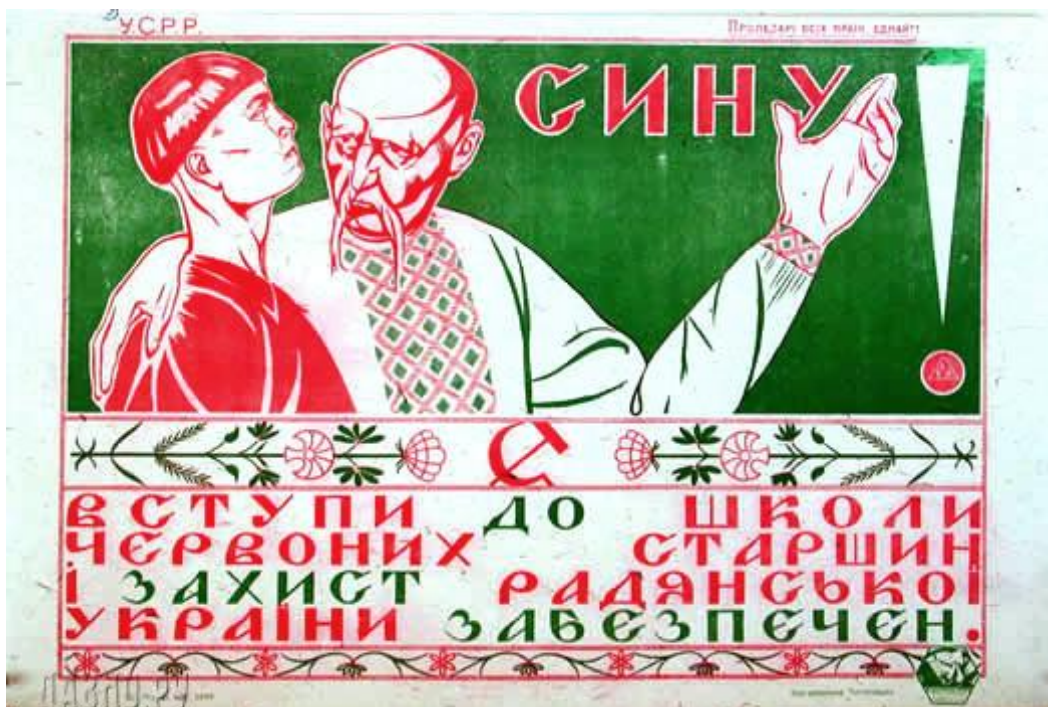
Soviet poster in Ukrainian on indigenization.

“The proletariat of the oppressing nations cannot confine itself to the general hackneyed phrases against annexations and for the equal rights of nations in general, that may be repeated by any pacifist bourgeois. The proletariat cannot evade the question that is particularly “unpleasant” for the imperialist bourgeoisie, namely, the question of the frontiers of a state that is based on national oppression. The proletariat cannot but fight against the forcible retention of the oppressed nations within the boundaries of a given state, and this is exactly what the struggle for the right of self-determination means. The proletariat must demand the right of political secession for the colonies and for the nations that “its own” nation oppresses. Unless it does this, proletarian internationalism will remain a meaningless phrase; mutual confidence and class solidarity between the workers of the oppressing and oppressed nations will be impossible.”