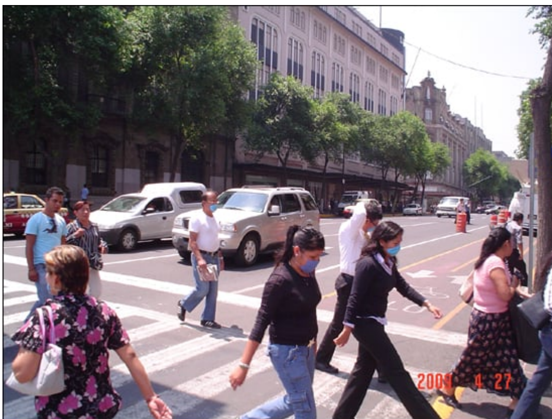
Mexico City street scene.

At times, these face masks in assorted in light blue and green were disturbed for free in the name of "public health safety" or sold as "souvenirs" in the market square. On other occasions, it seemed as if everywhere, I went that is restaurants stores, hotels, government buildings etc (those which still remained open), almost everyone looked like a dental hygienists.