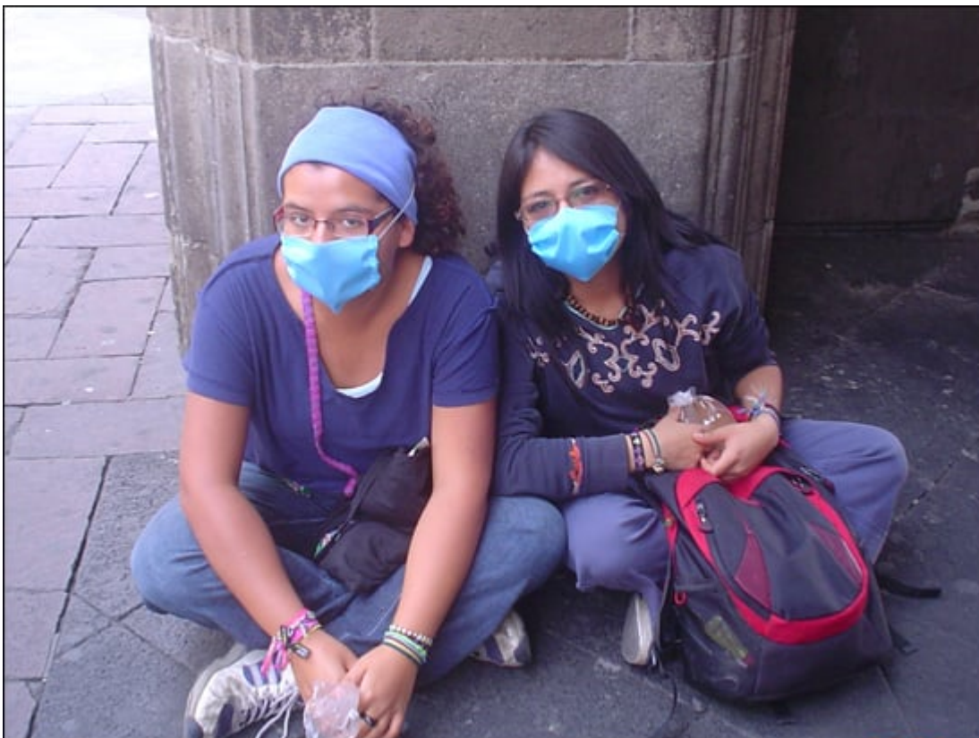
Citizens of Mexico City

In-depth Report: THE H1N1 SWINE FLU PANDEMIC