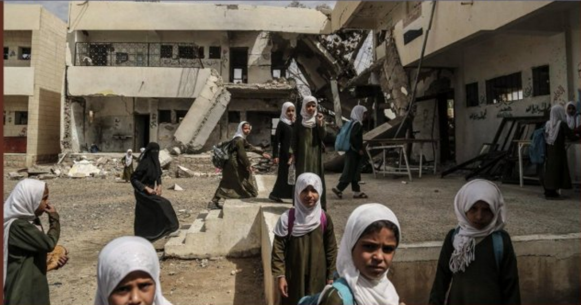
Students of al-Munadhil school for girls during a break. The school has been bombed by the Saudi-led coalition during raids in Saada.

Academic research published in Guardian establishes that "more than one-third of all Saudi-led air raids on Yemen have hit civilian sites, such as school buildings, hospitals, markets, mosques and economic infrastructure"