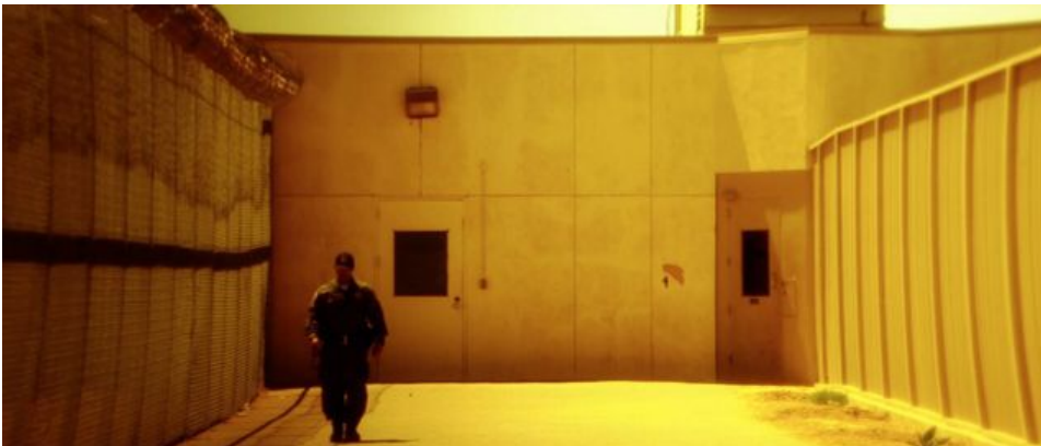
Survivors Guide to Prison

Survivors Guide acknowledges that “if you’re rich and guilty you have a much better chance than if you’re poor and innocent.”