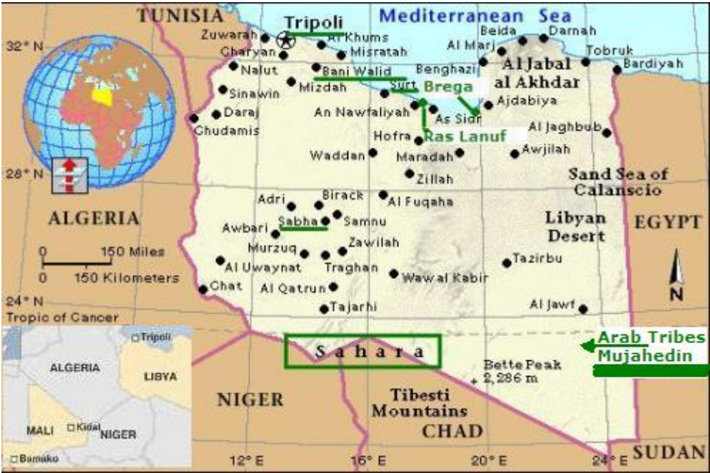
Locations of major battles and incoming support for the resistance are indicated in green. - Axis of Logic

In Tripoli the fighting continues. There are constant battles between the local militias (the residents of the capital) and the “rebels” NATO and mercenaries from Al-Qaeda.